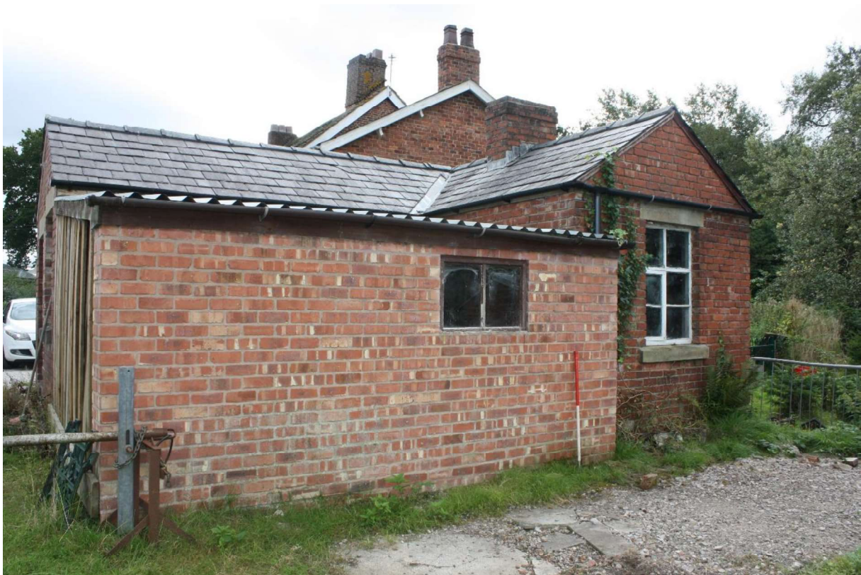
Plate 49 West elevation of the cottage with a modern extension, facing southeast.