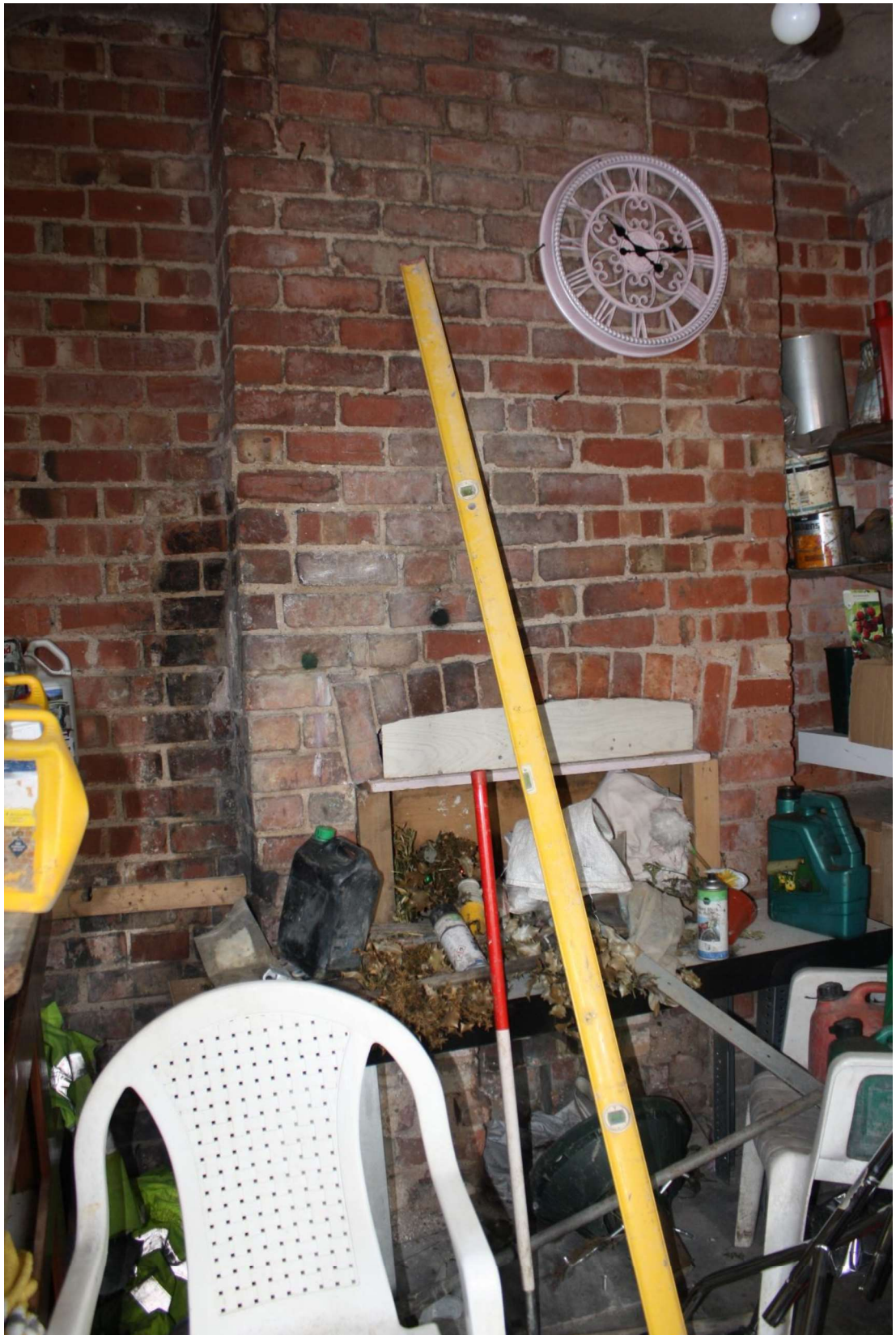
Plate 54 Fireplace in Room 3, facing southeast.