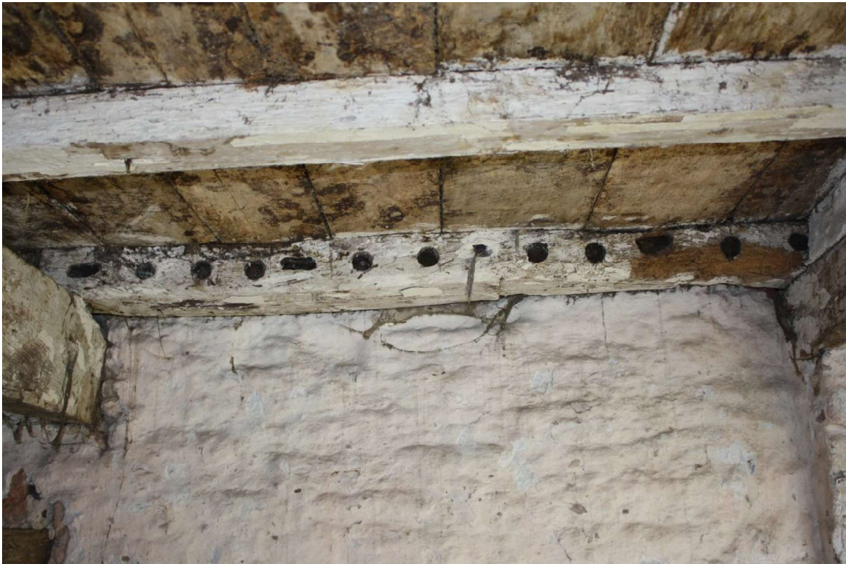
Plate 30 Possibly reused timber in the cowhouse, facing west.