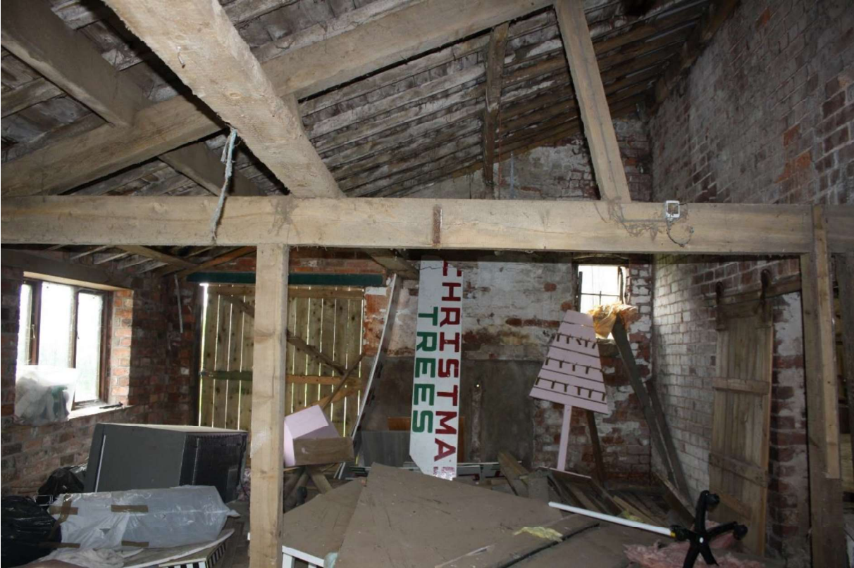
Plate 42 Interior of the east outshut, facing south.