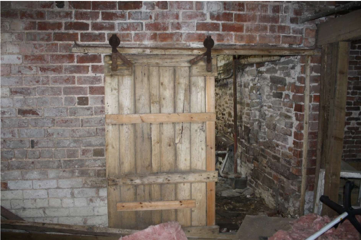
Plate 43 Sliding door in the east outshut, facing west.