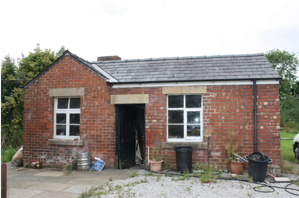
Plate 45 East elevation of the cottage, facing west.