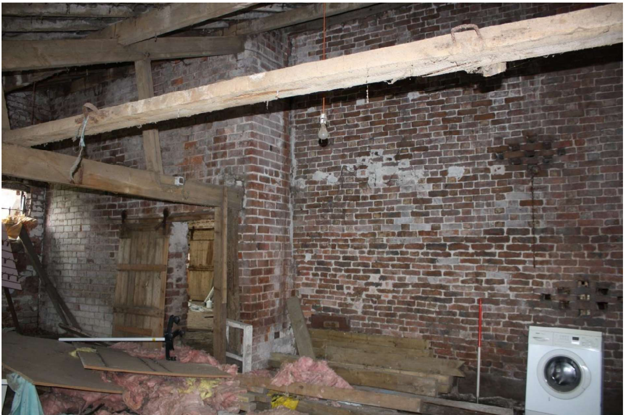
Plate 41 East elevation of the main range, facing southwest.