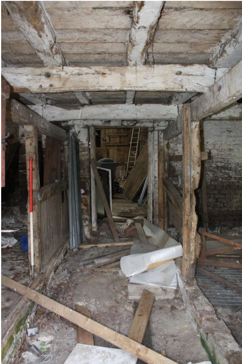
Plate 34 Central passage in the north shippon, facing south.