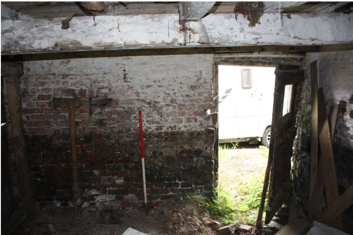
Plate 36 Door in the north elevation. Large beam supporting the hayloft.