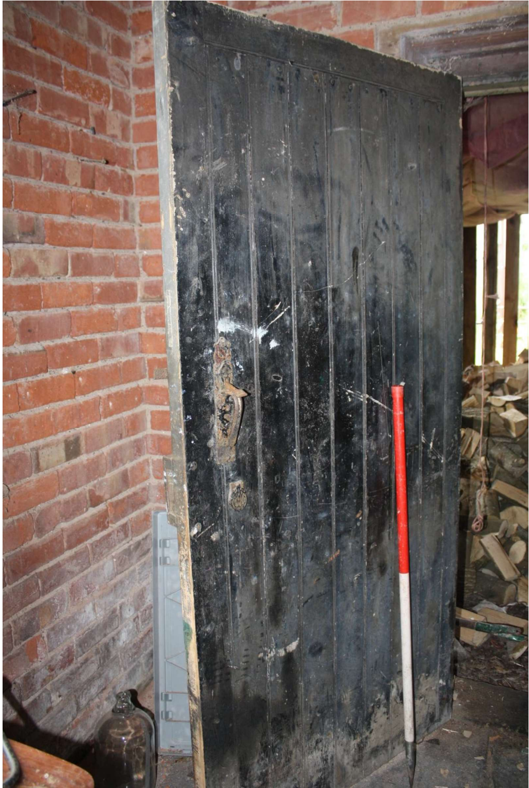
Plate 56 Door between Room 1 and modern outshut, facing east.