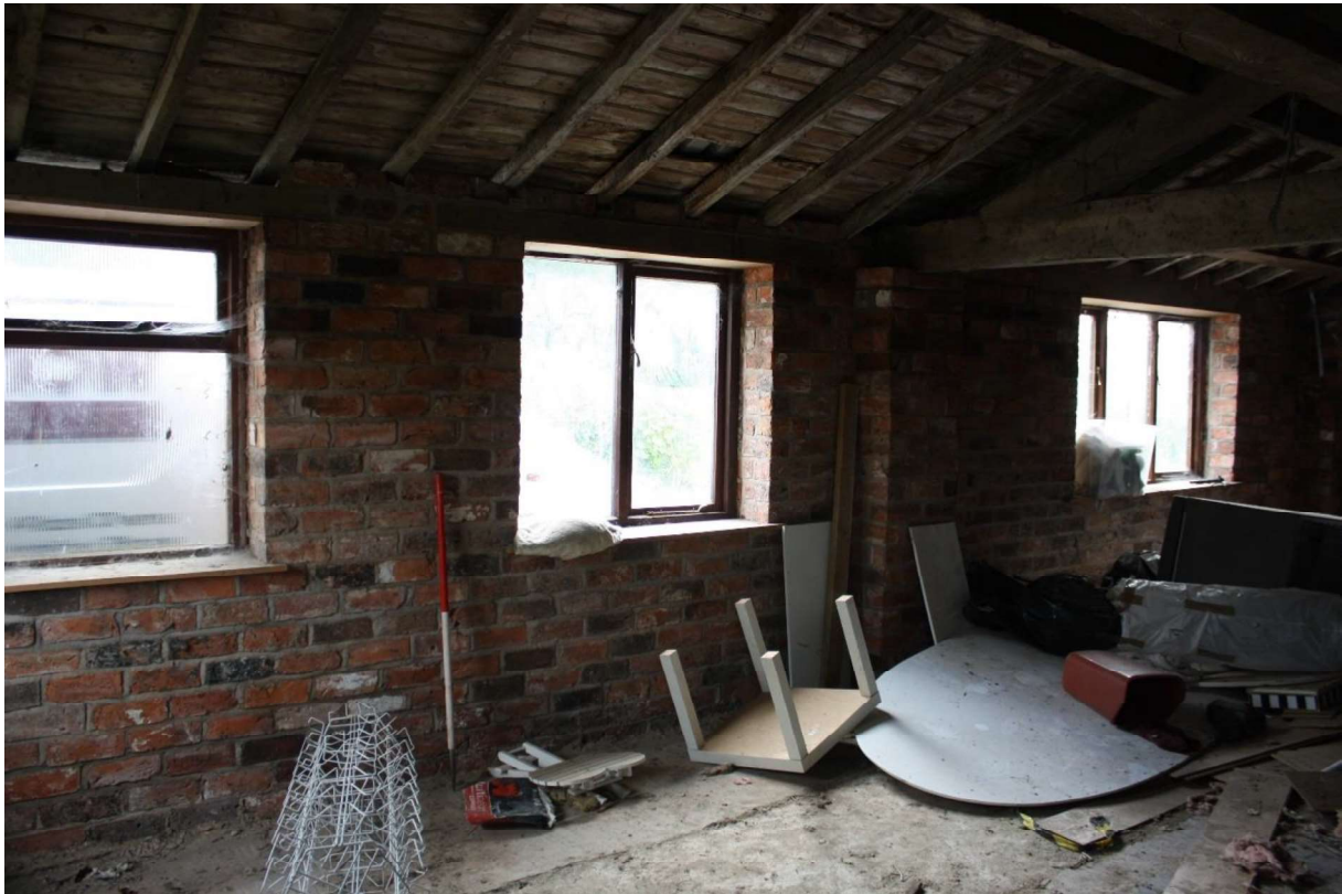
Plate 44 Modern part of the east outshut, facing southeast.