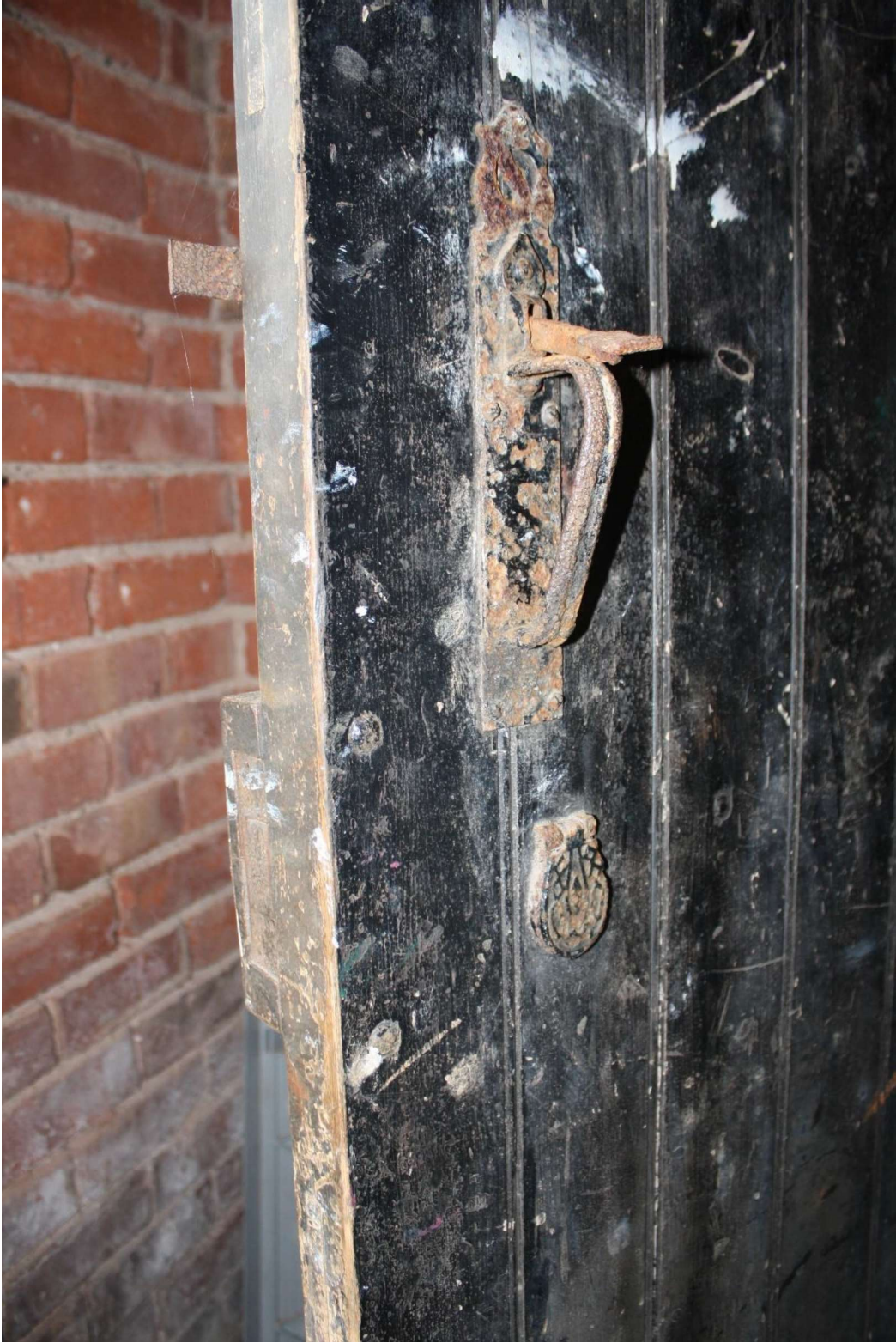
Plate 57 Ornate handle in Room 1.