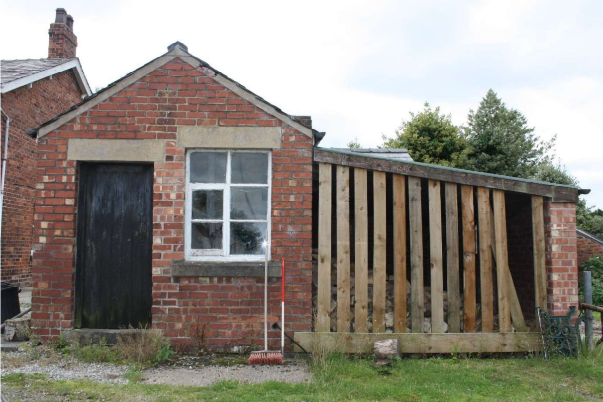
Plate 51 North elevation of the cottage, facing south.