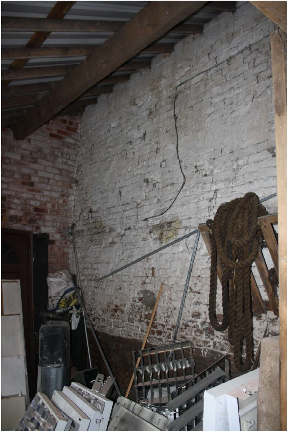
Plate 39 North part of the west outshut, facing northeast.