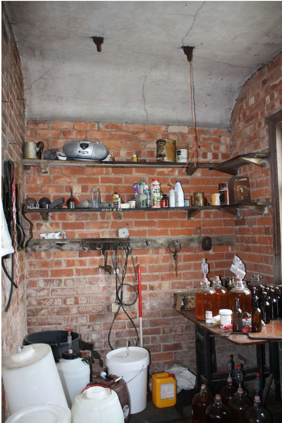
Plate 53 Room 2 in the cottage, facing south.