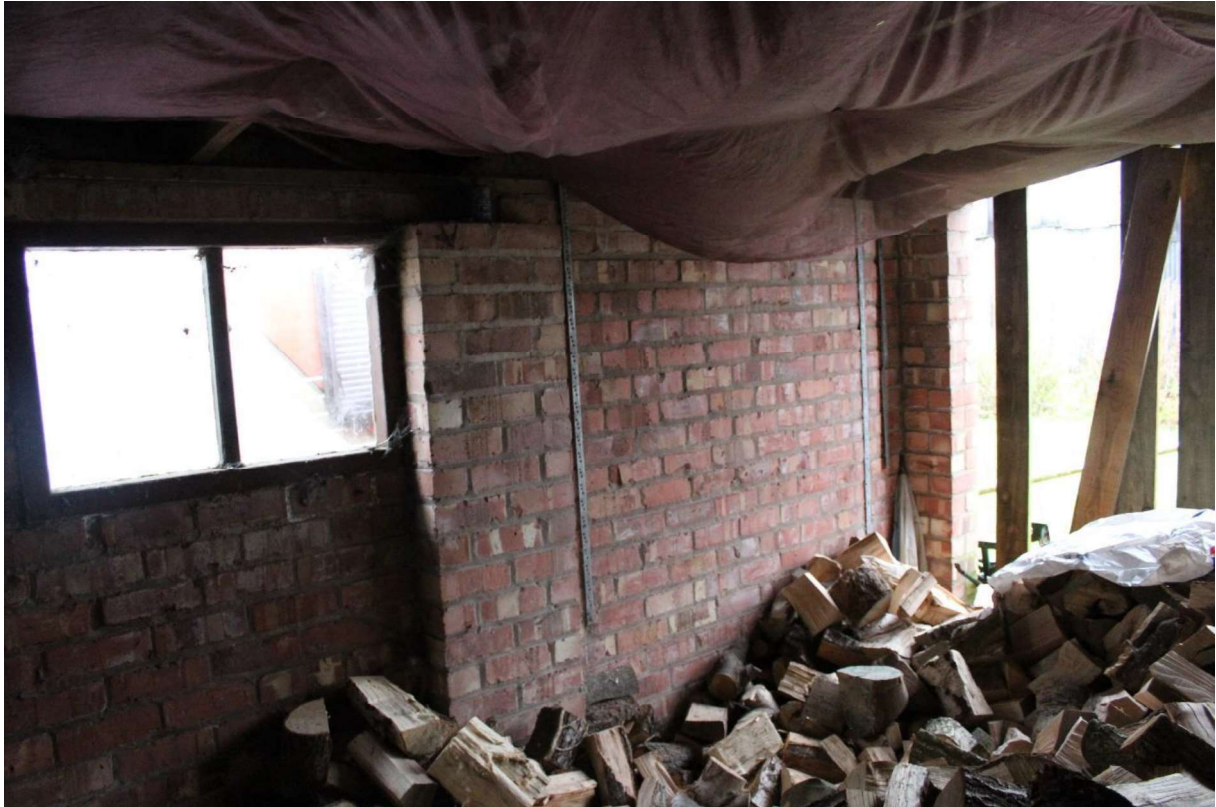
Plate 58 Modern extension, facing northwest.