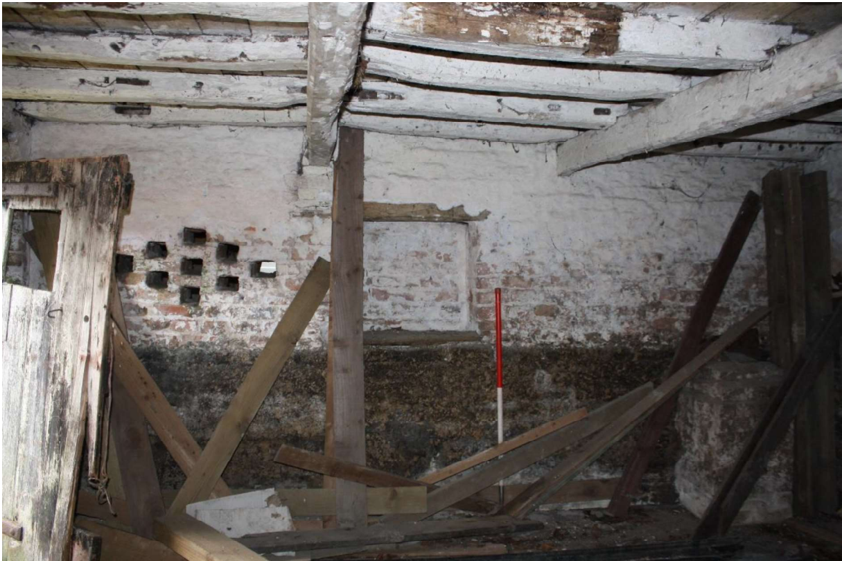
Plate 35 Blocked aperture in the north shippon. Facing west.