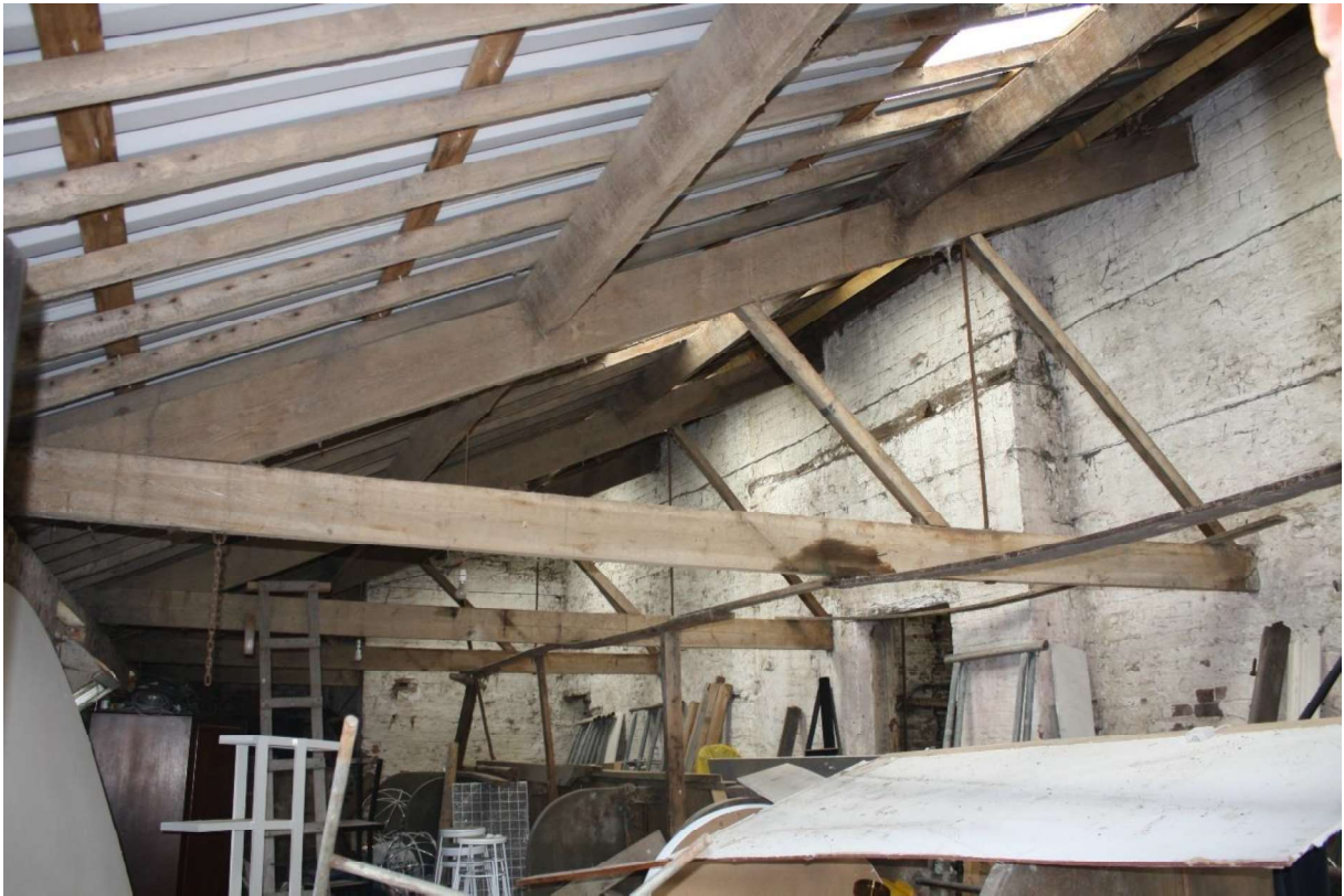
Plate 37 West outshut interior, facing north.