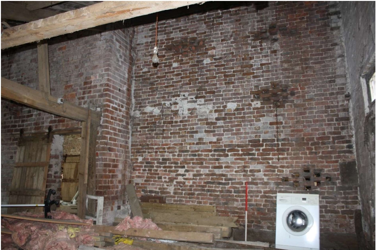
Plate 40 Interior of the east outshut, facing southwest.