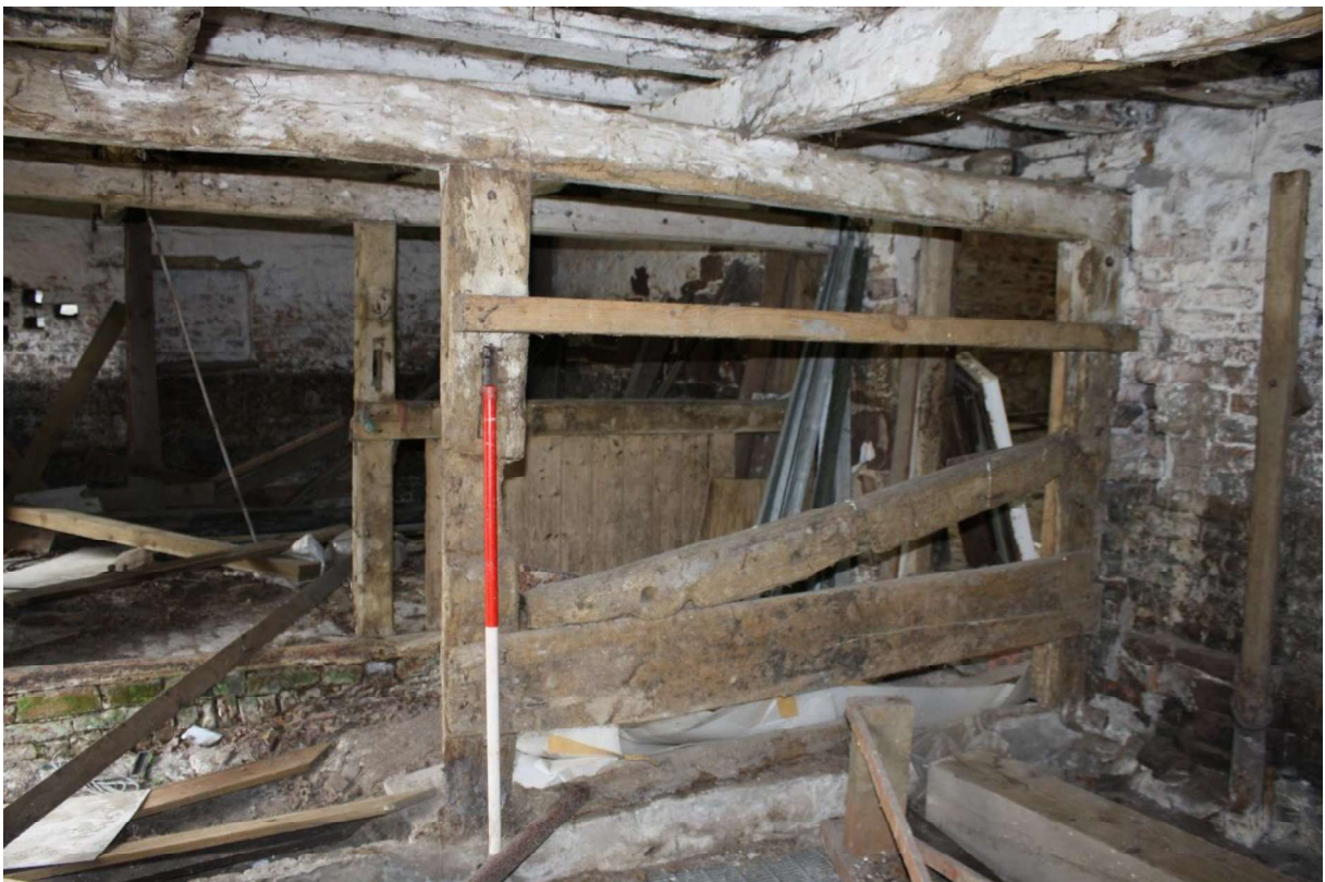
Plate 33 Timber stalls in the cowhouse, facing southeast.