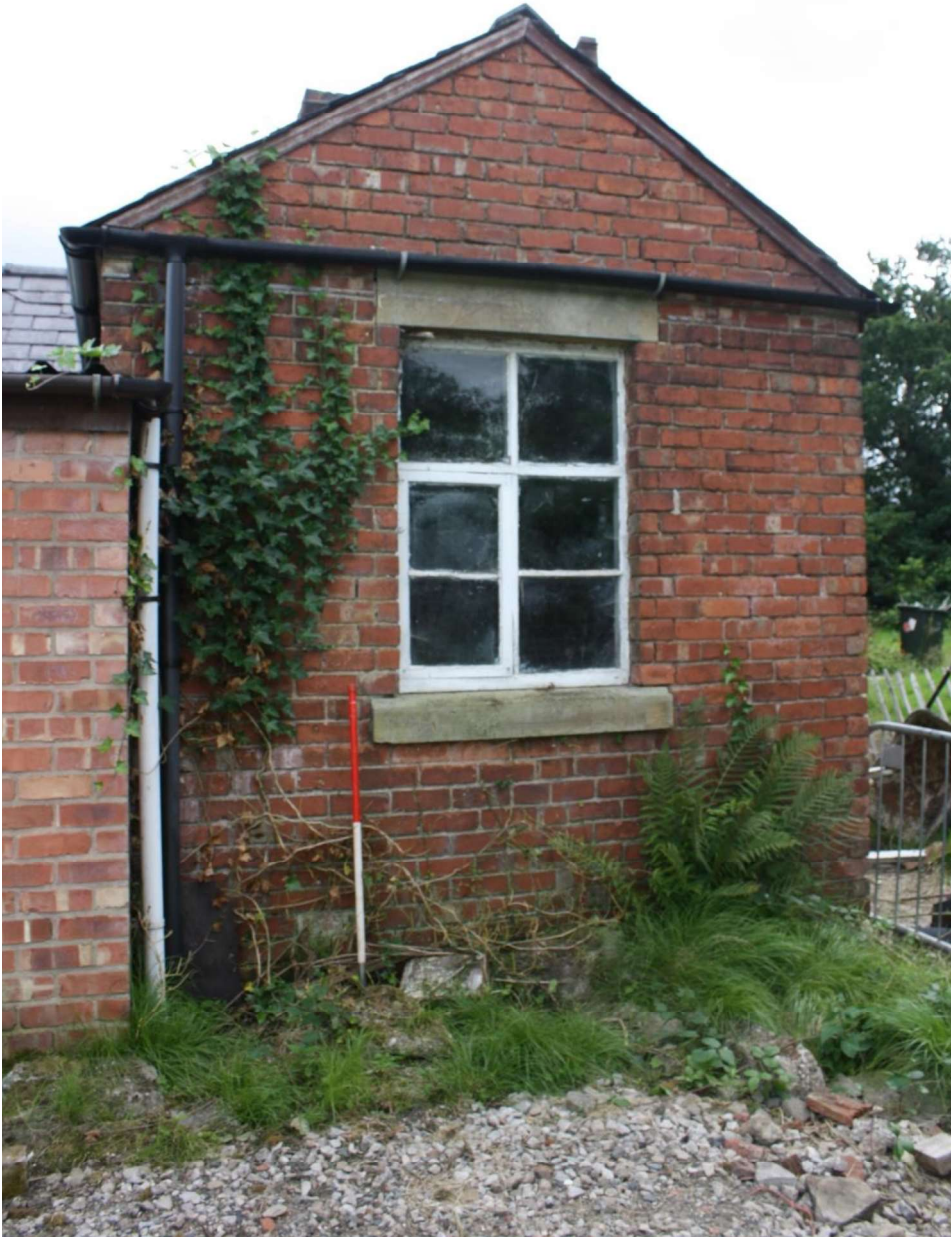
Plate 50 West gable of the cottage, facing southeast.