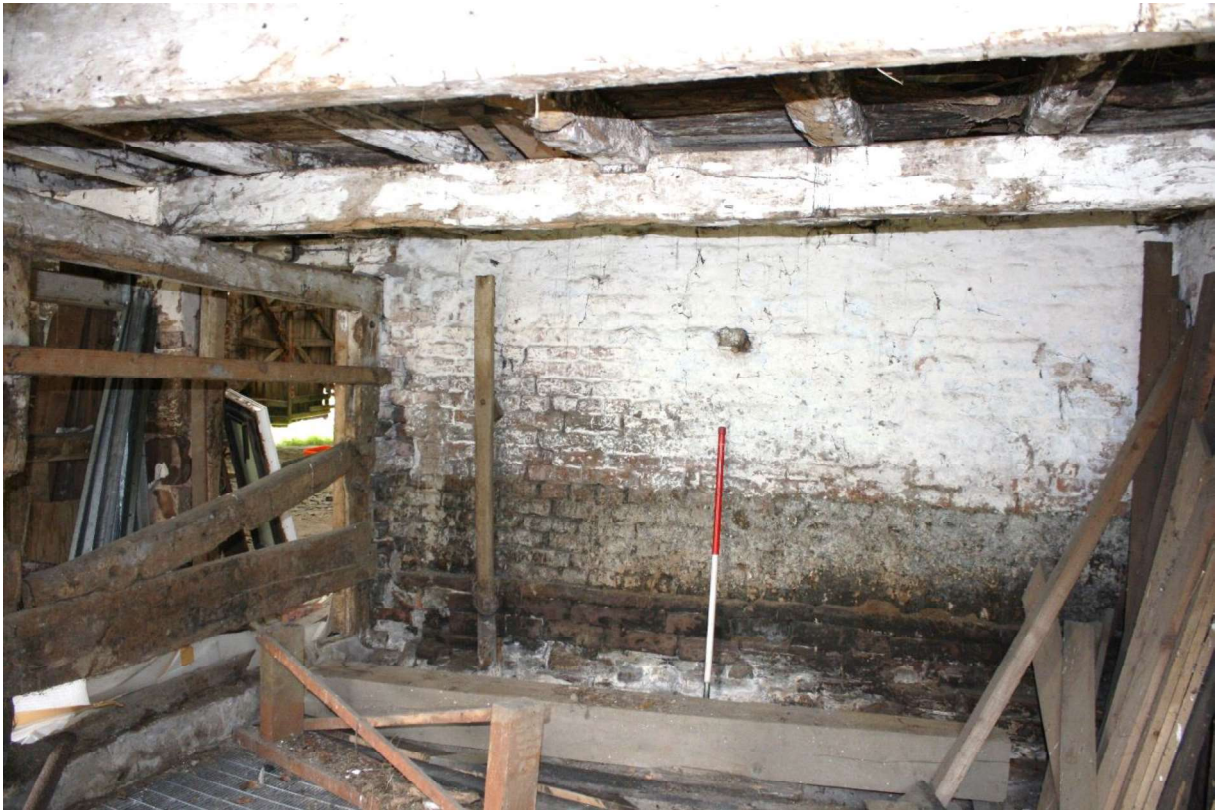
Plate 32 North shippon, facing southeast.