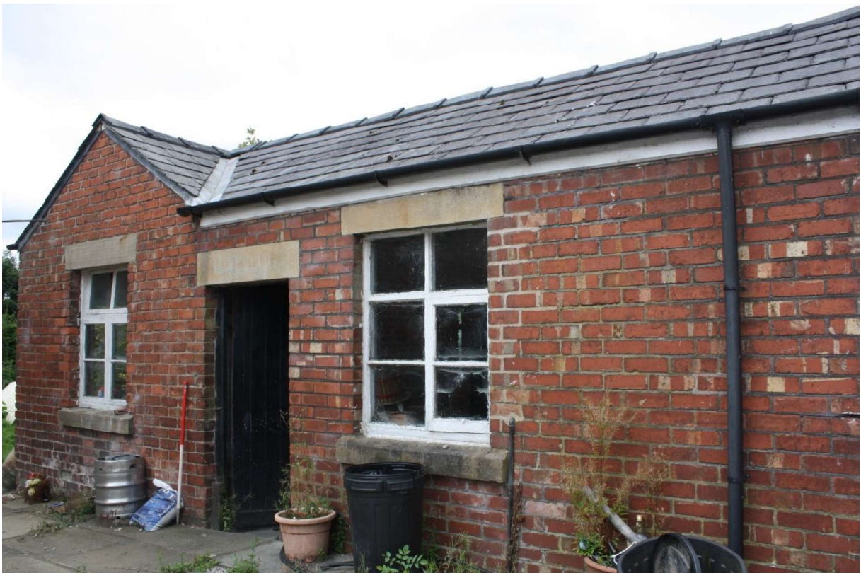
Plate 47 East elevation of the cottage, facing southwest.