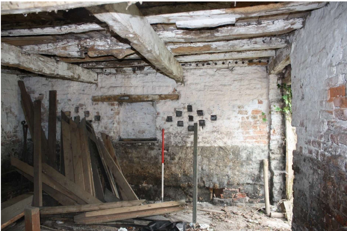
Plate 31 West internal elevation of the cowhouse, facing west.