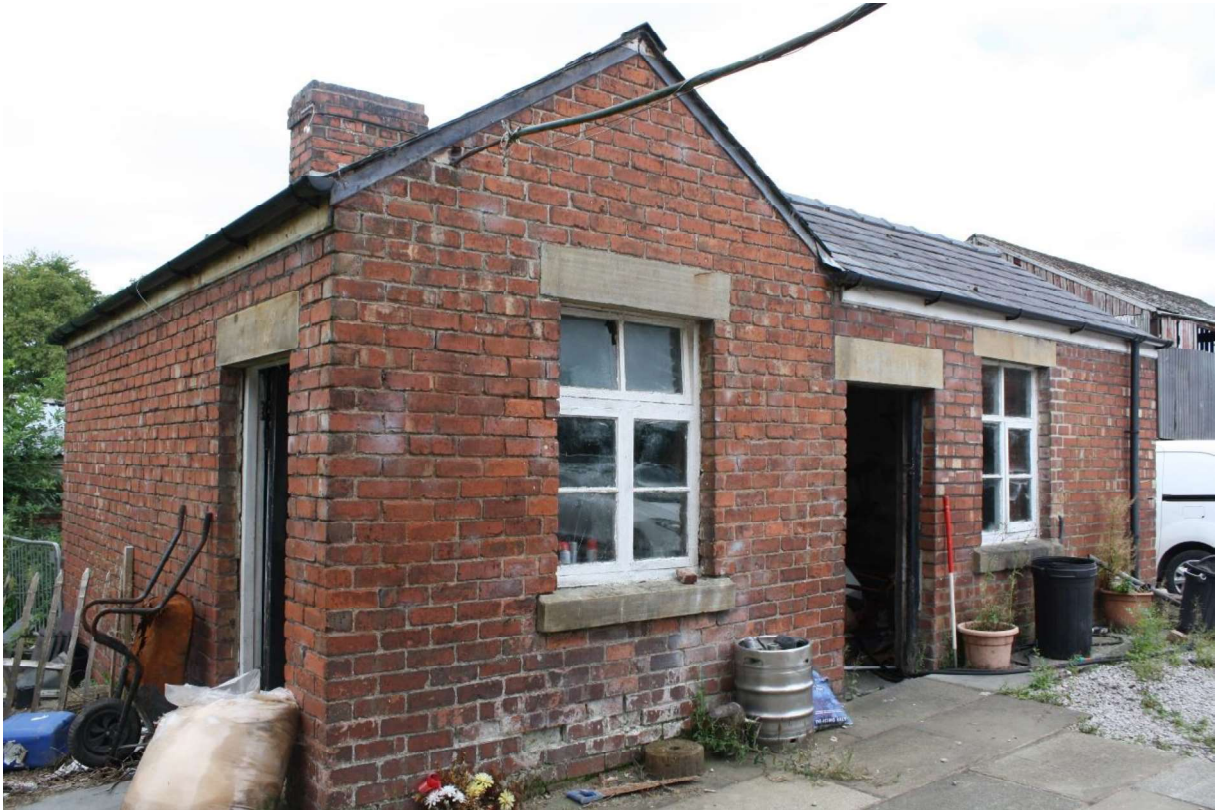
Plate 46 General view of the cottage, facing northwest.