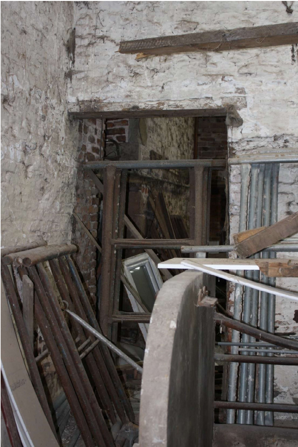
Plate 38 Doorway in the west elevation of the barn, facing east.