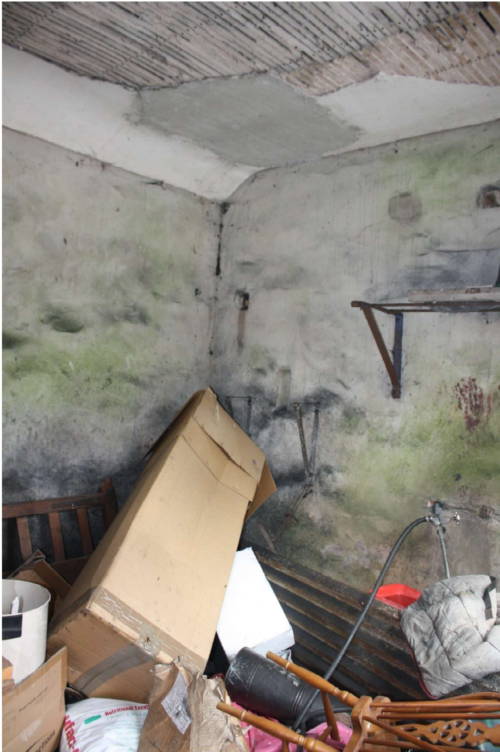
Plate 52 Room 1 in the cottage, facing southeast.