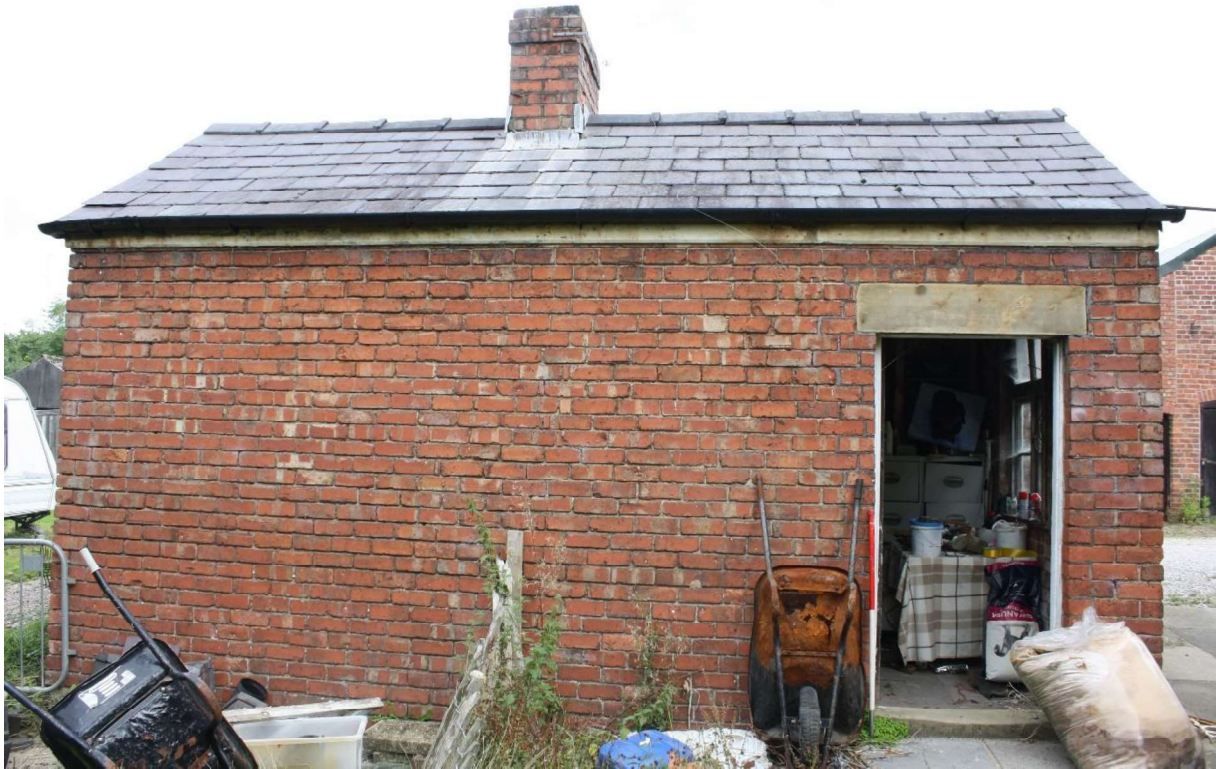
Plate 48 South elevation of the cottage, facing north.