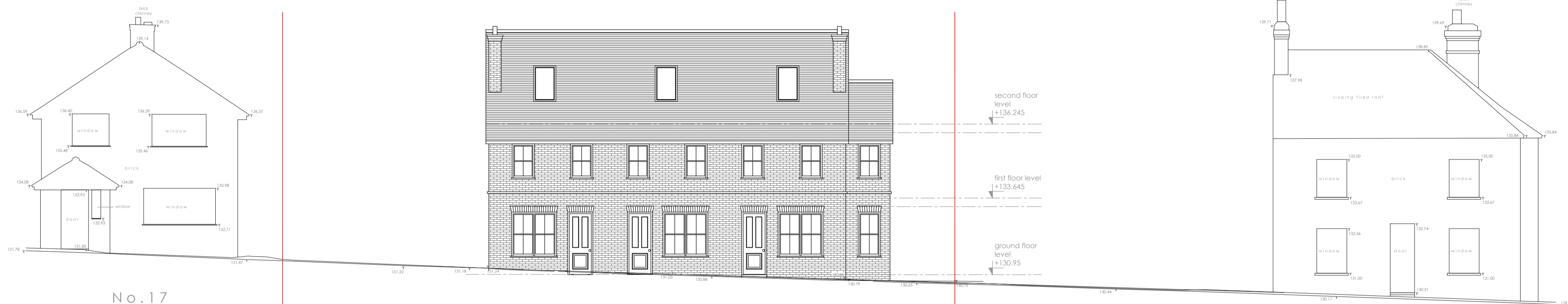
No.17 No.19-21 HIGH STREET No.23 PROPOSED SOUTH-WEST ELEVATION