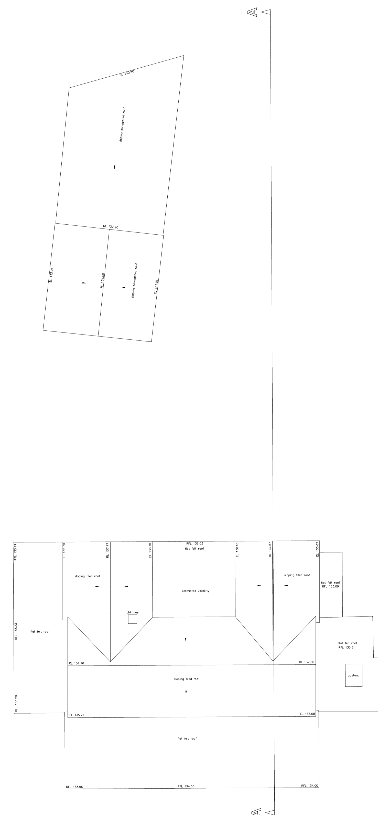
EXISTING ROOF PLANS