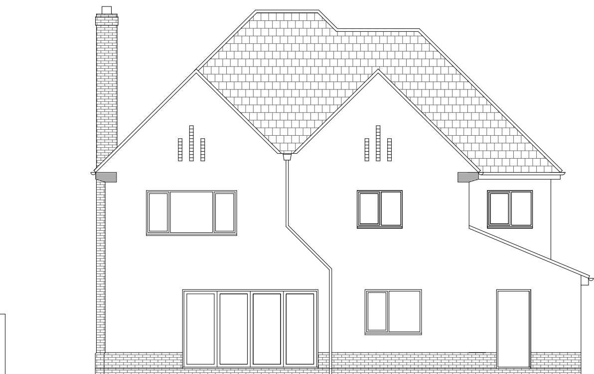
existing rear elevation