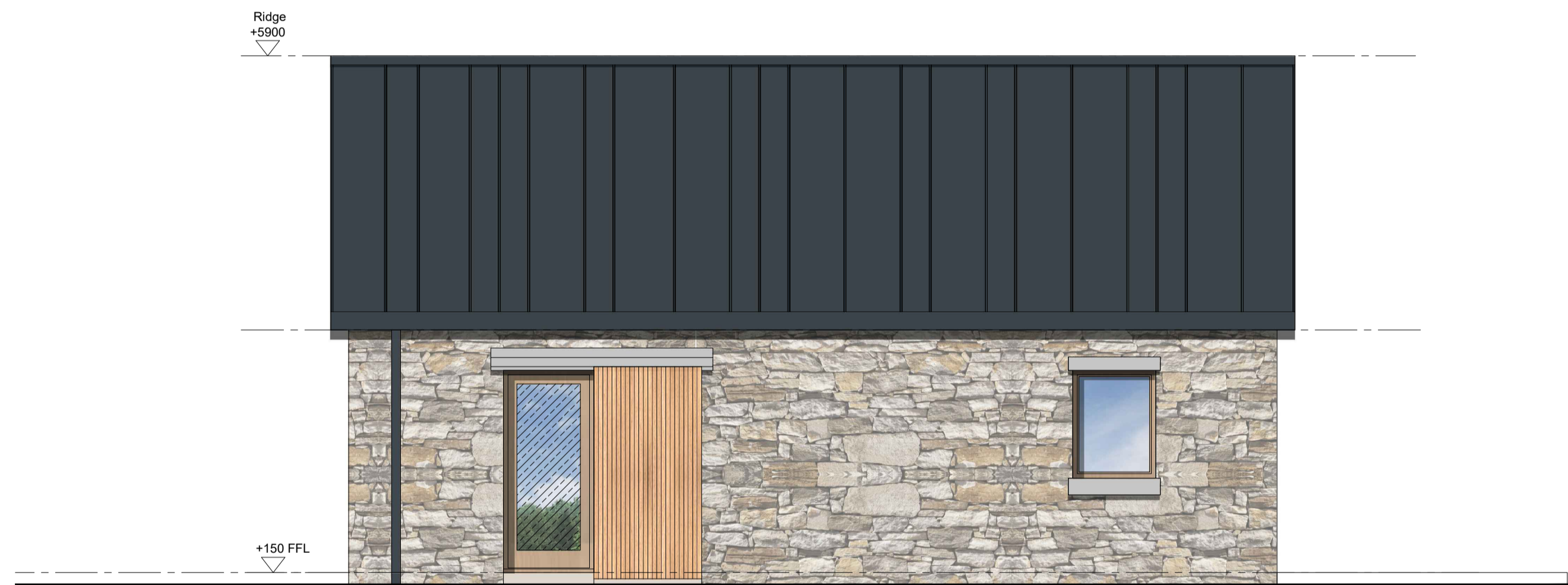
Proposed West Elevation