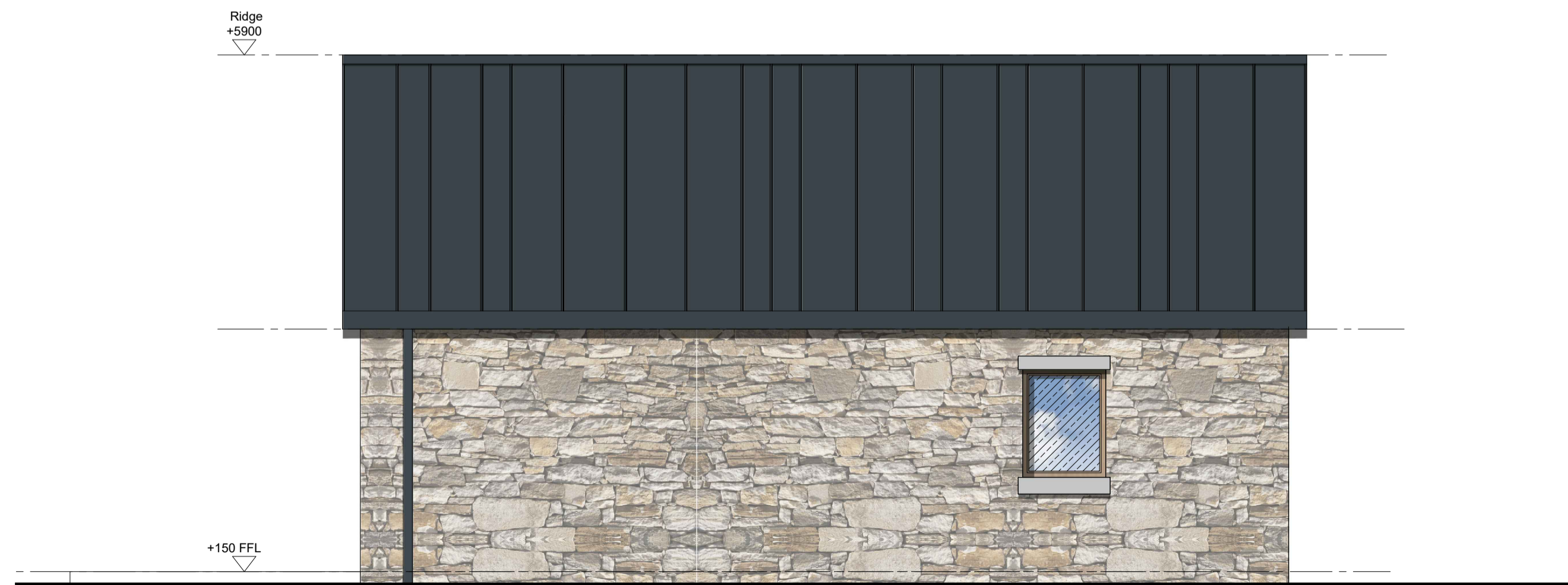
Proposed East Elevation