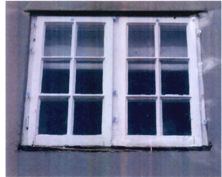
Existing windows, ground floor (below) and first floor (above).