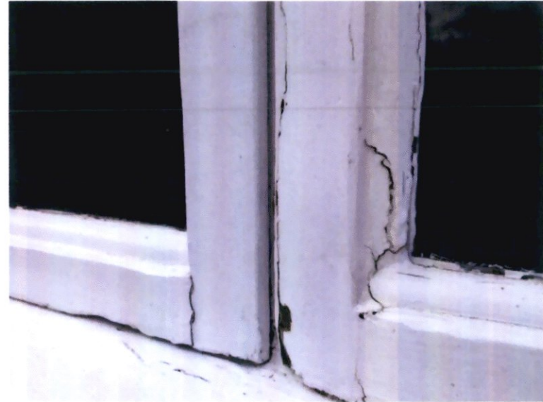
Detailed photographs of existing windows, ground floor, eastern elevation.