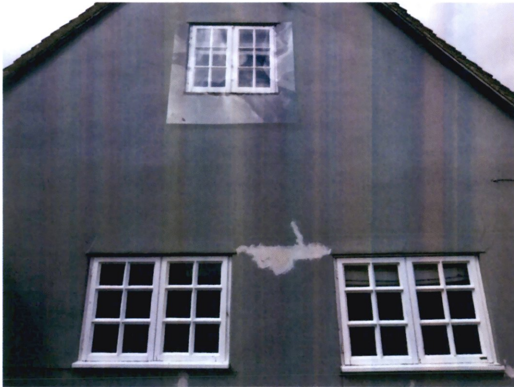
Eastern elevation showing existing windows.