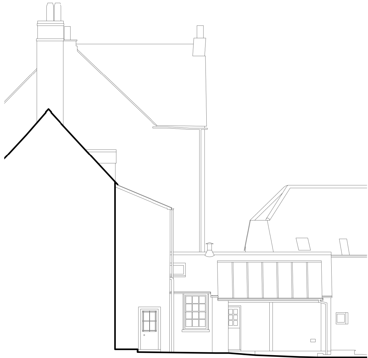
Existing Elevation - West