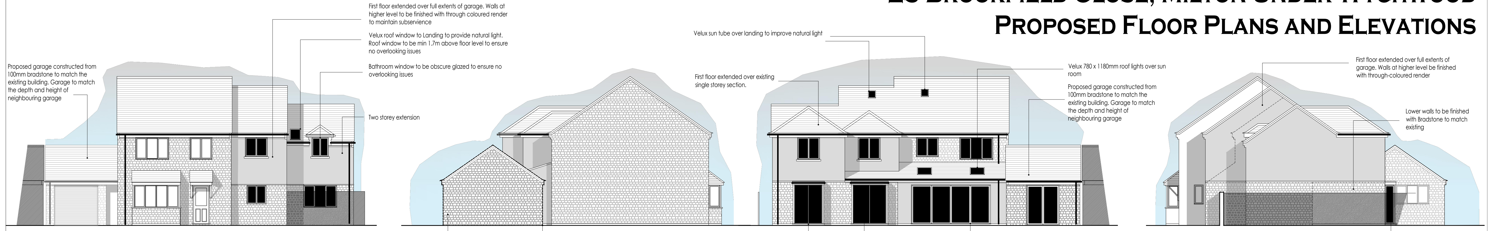
North West Elevation scale 1:100