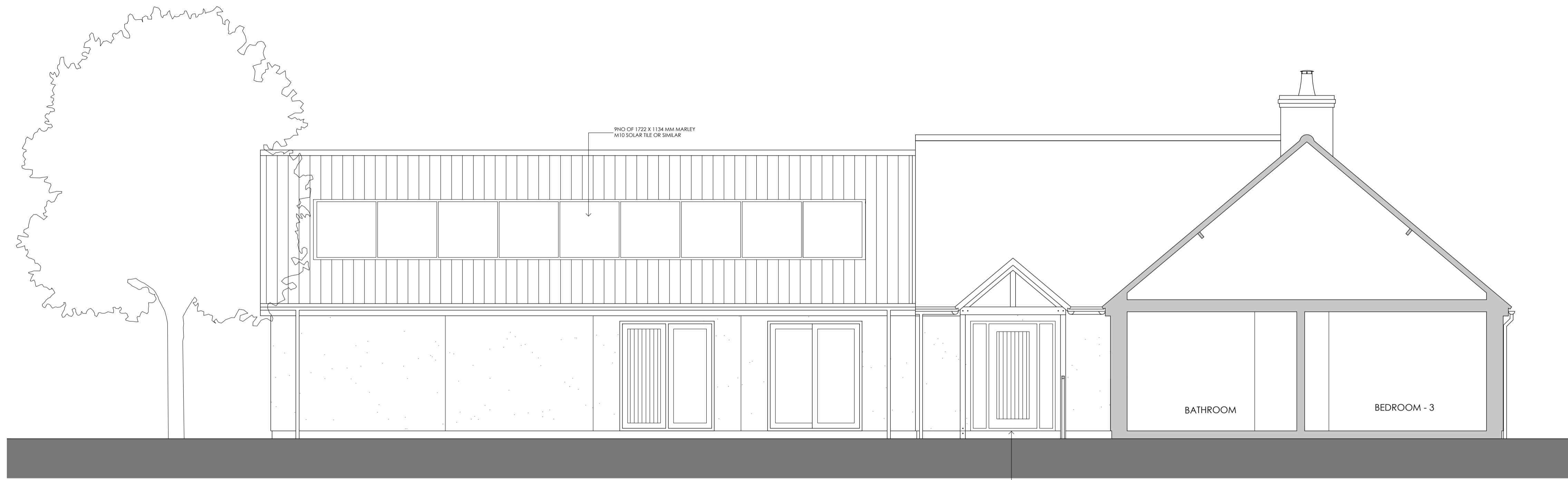
PROPOSED HIDDEN SOUTH ELEVATION

Do not scale off this drawing - All dimensions and setting out to be verified on site. If in doubt contact the originator for clarification. This drawing is the property of FRAMEWORK. Copyright is reserved by them and the drawing is issued on the condition that it is not copied, reproduced, retained or disclosed to any unauthorised person, either wholly or in part without the consent in writing of FRAMEWORK.