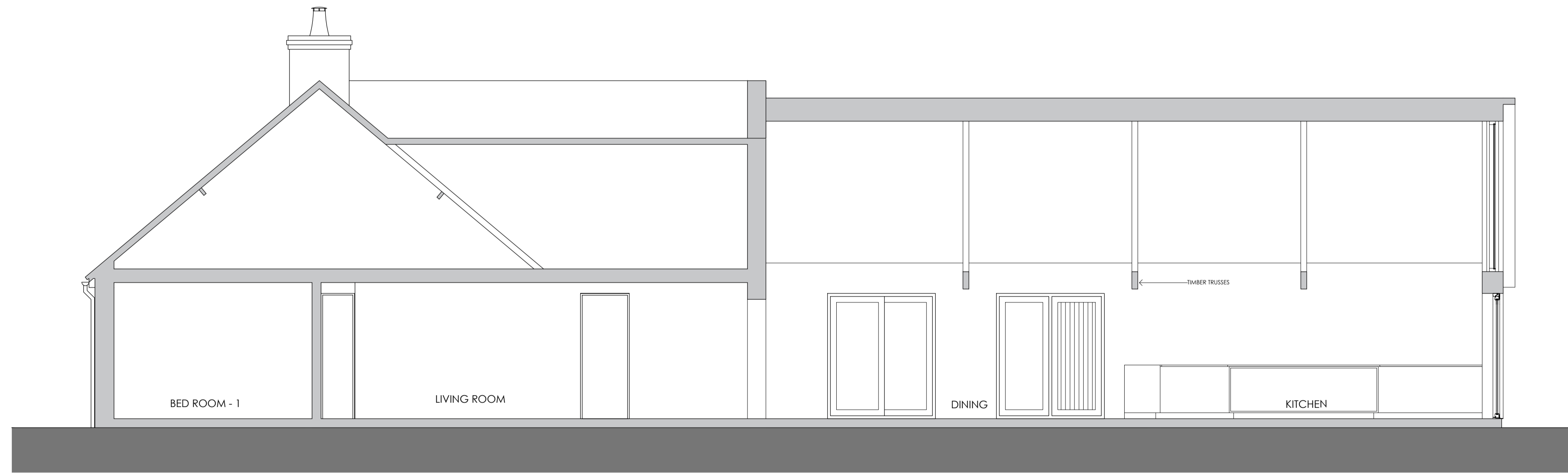
PROPOSED SECTION - AA

NEW STEEL FRAME WITH TIMBER PANELS TO SCREEN EXISTING BOILER