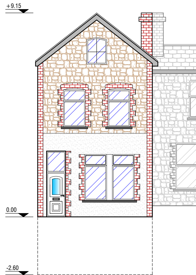
Front view - North