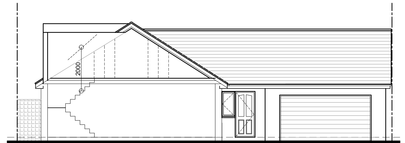
Proposed Section - AA Scale 1:100