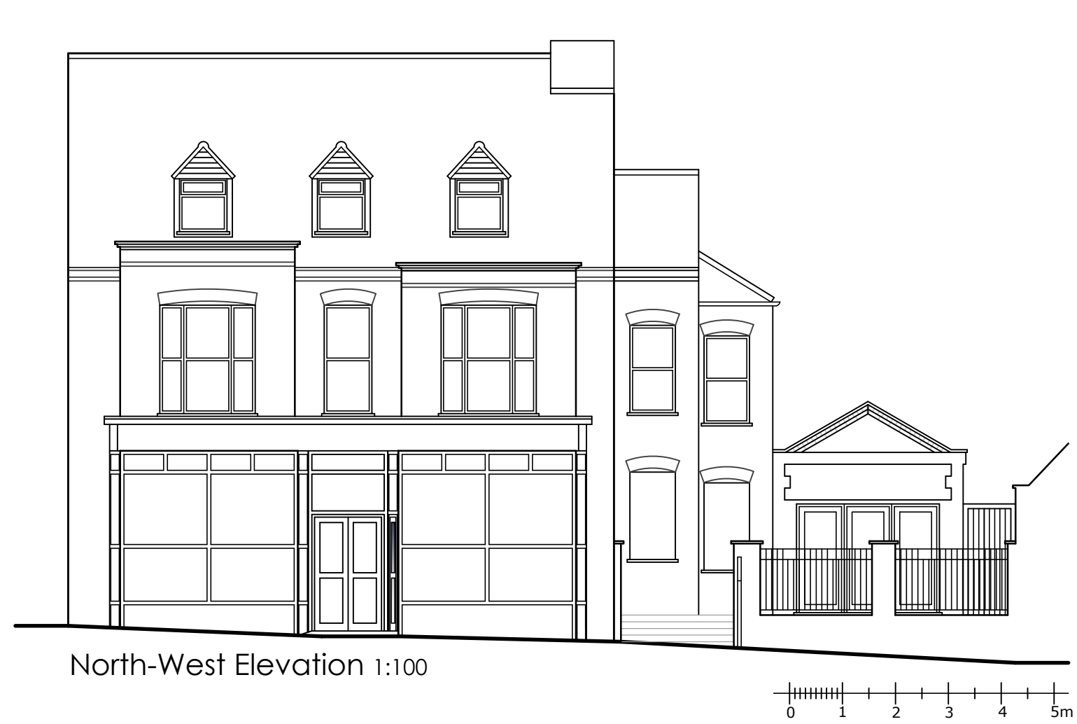
North-West Elevation 1:100