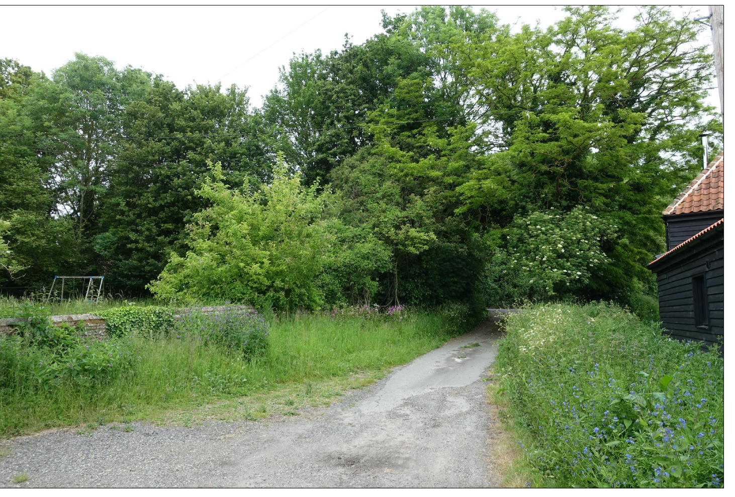
View looking Northeast towards entrance showing 1.5m high garden wall, 3.5m section to be removed as indicated on block plan