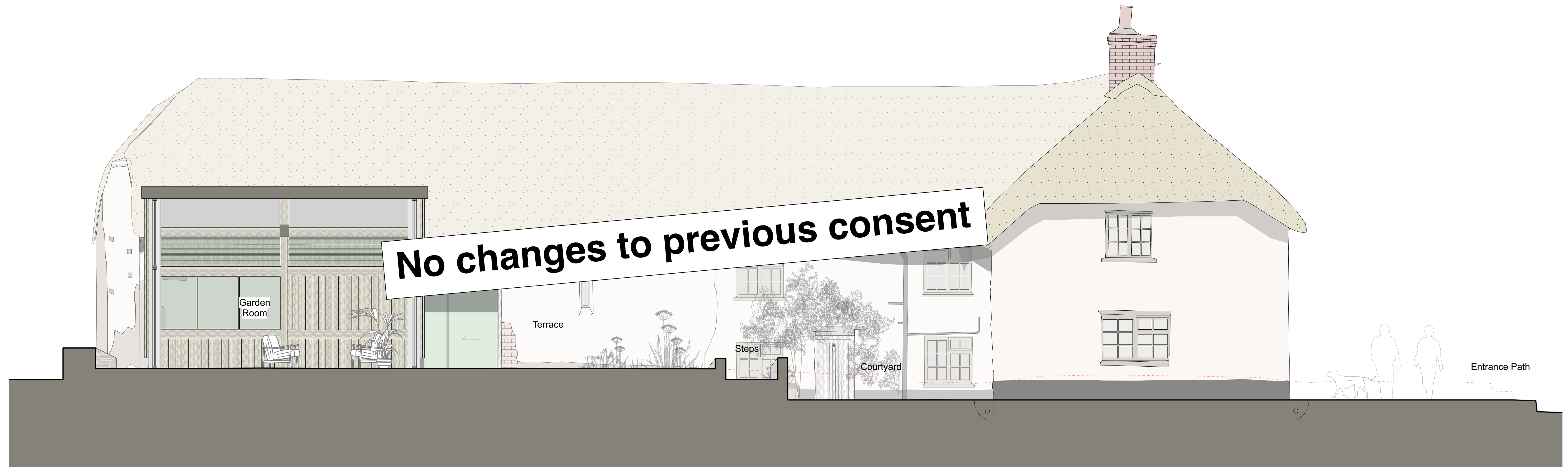
02. Proposed Section BB