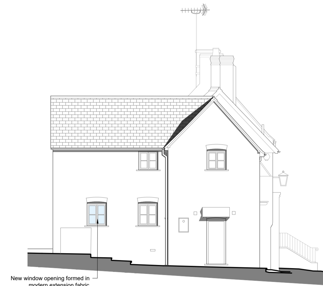
4 - Side (East) Elevation (1:100)