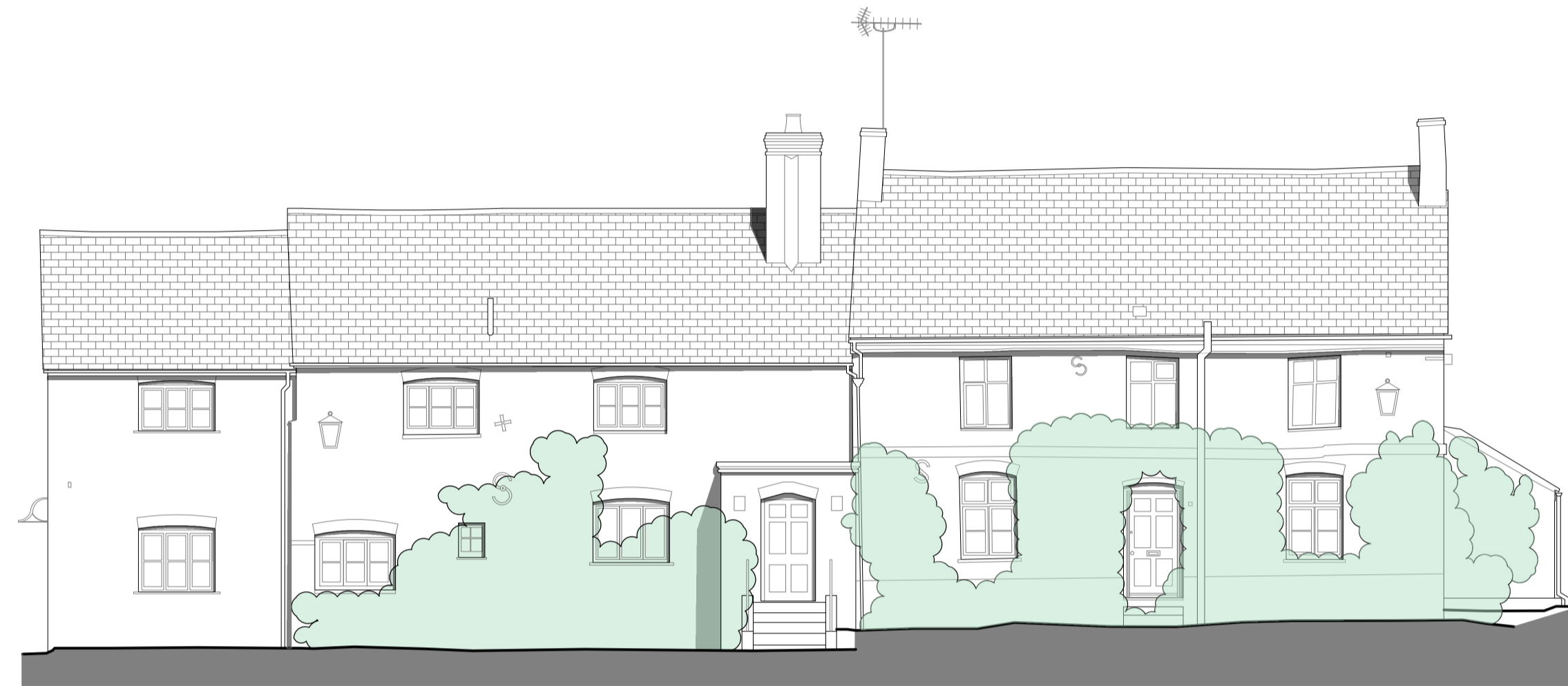
1 - Front (North) Elevation (1:100)