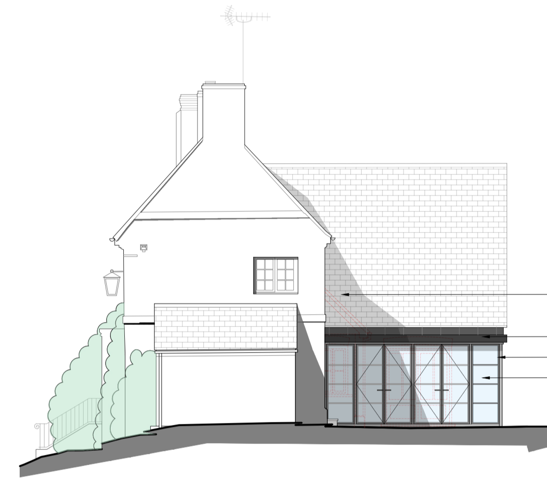
2 - Side (West) Elevation (1:100)