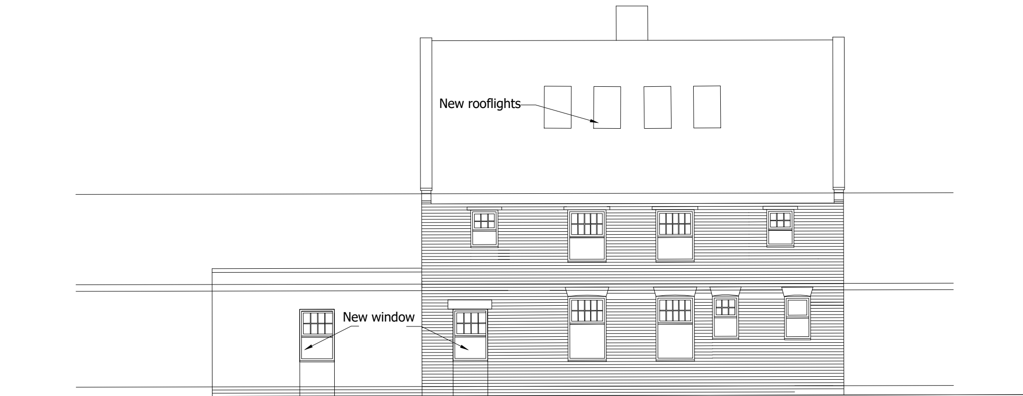
○ Rear elevation SCALE 1:100