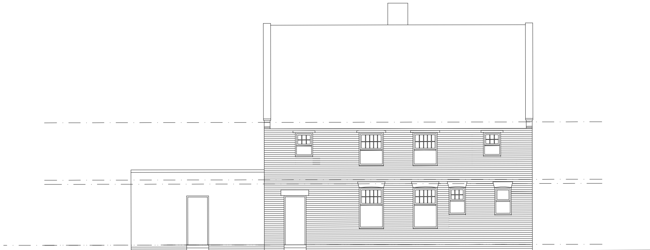
○ Rear elevation SCALE 1:100