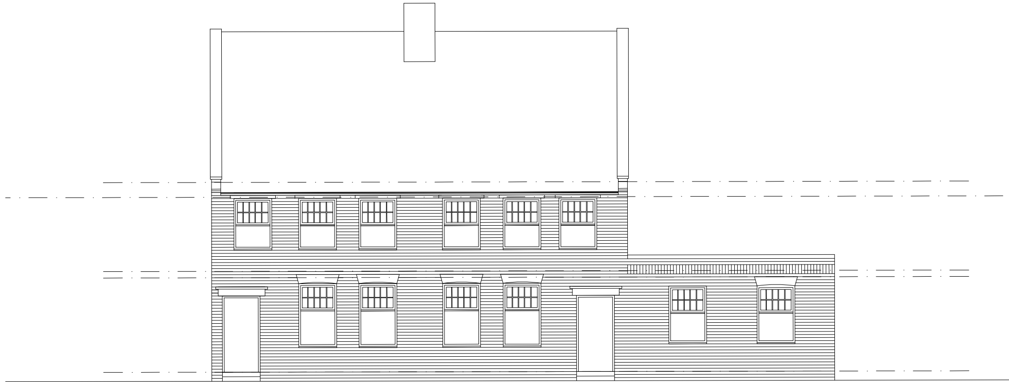
○ Elevation to Princess Louise Road SCALE 1:100