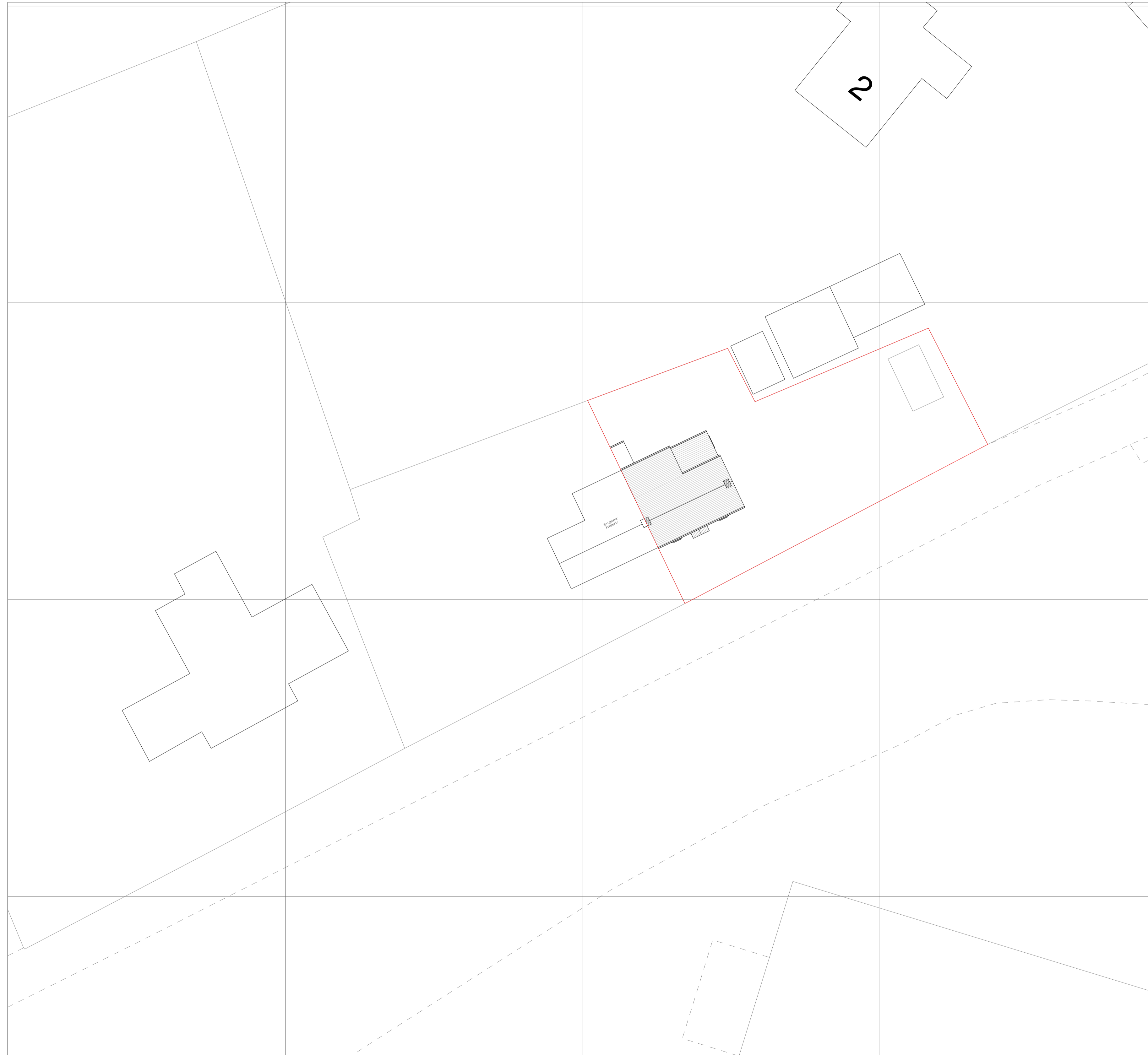
① Block Plan Existing 1 : 200

COMMUNITY INFRASTRUCTURE LEVY (CIL): Projects may attract the CIL levy payable to the Local Authority as noted on the relevant Planning Permission Decision Notice. If this is the case, the applicant can apply for an exemption on the basis of self-build, an annexe, or an extension to your primary residence but this must be done before commencement of construction otherwise the levy will become payable. The applicant must also submit a CIL Commencement Notice before commencement of construction otherwise the levy will become payable without right of appeal.