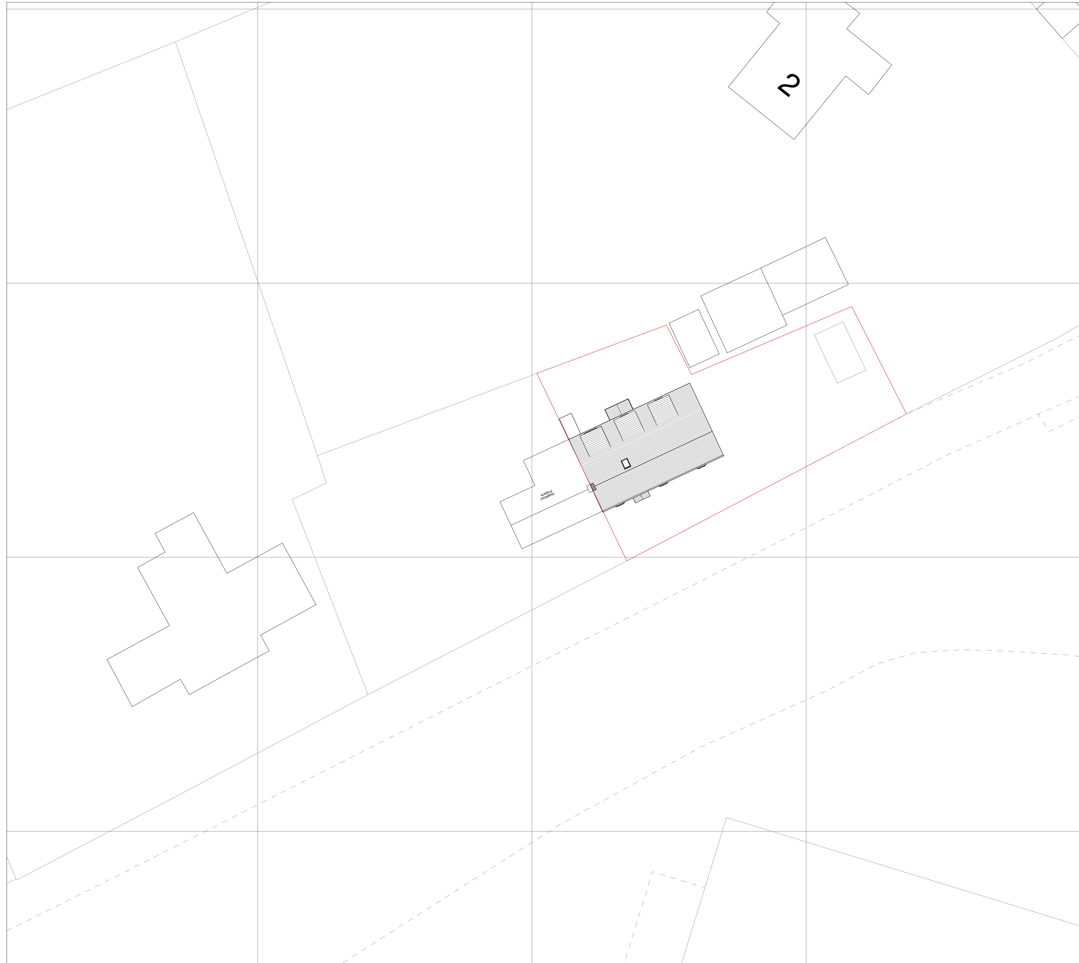
① Block Plan Proposed 1 : 200

COMMUNITY INFRASTRUCTURE LEVY (CIL): Projects may attract the CIL levy payable to the Local Authority as noted on the relevant Planning Permission Decision Notice. If this is the case, the applicant can apply for an exemption on the basis of self-build, an annexe, or an extension to your primary residence but this must be done before commencement of construction otherwise the levy will become payable. The applicant must also submit a CIL Commencement Notice before commencement of construction otherwise the levy will become payable without right of appeal.