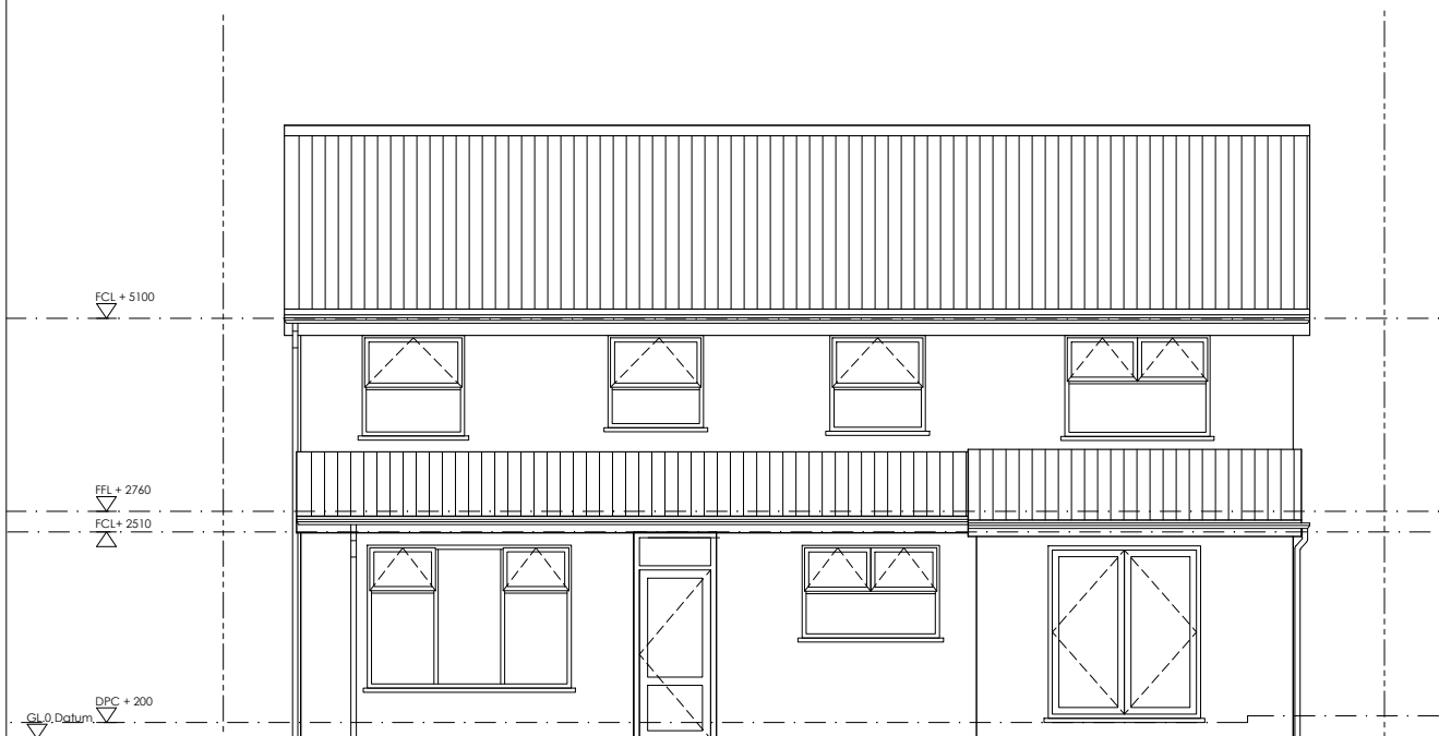
EXISTING REAR ELEVATION C