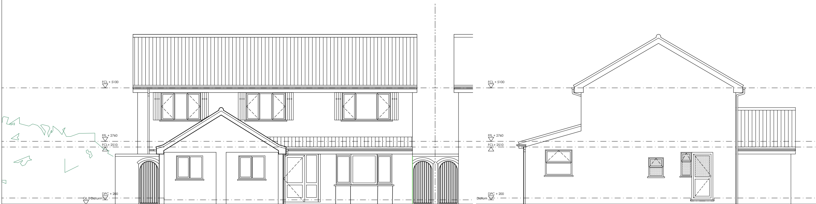
EXISTING FRONT ELEVATION A