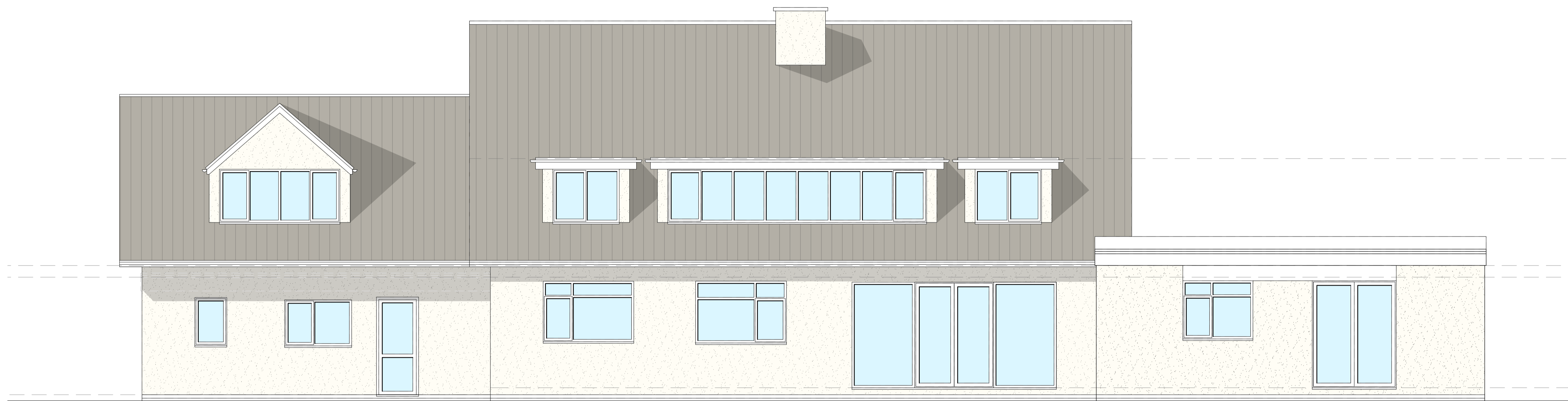
PROPOSED REAR ELEVATION 1:50