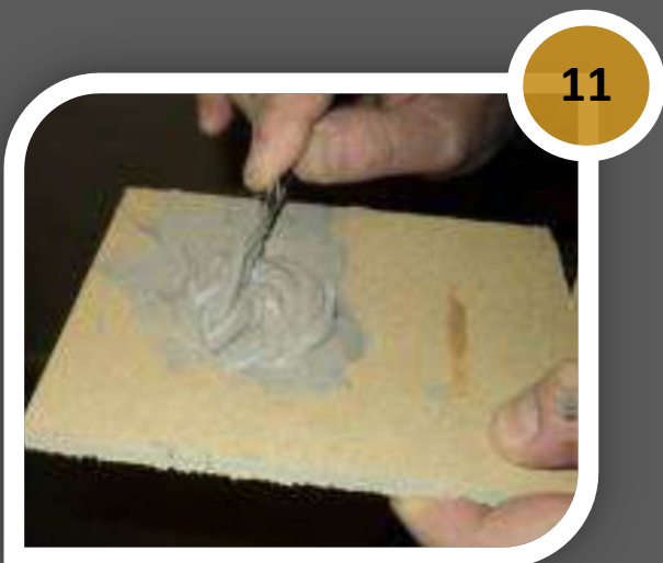
Ensure that when mixing the mortar compound you create an even colour with no streaks and an even consistency.