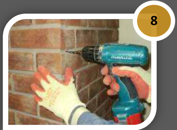
Repeat steps 4 & 5.