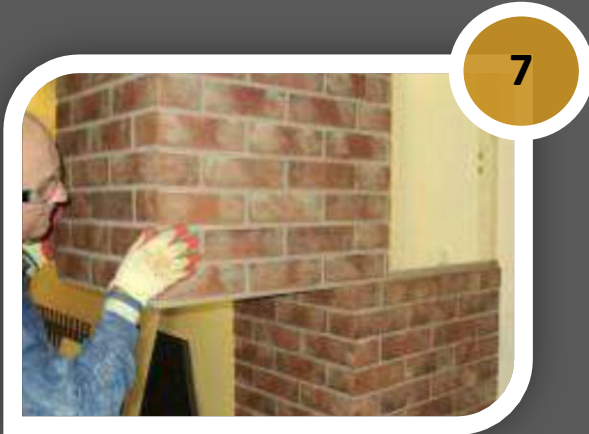
Once the bottom section of the cover has been installed, Offer next section up to the top of the first one, sliding it over the overlap.