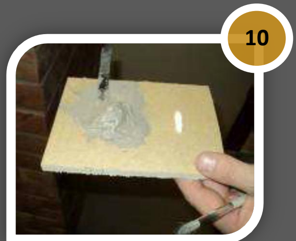
Mix the provided mortar compound following the enclosed instructions.