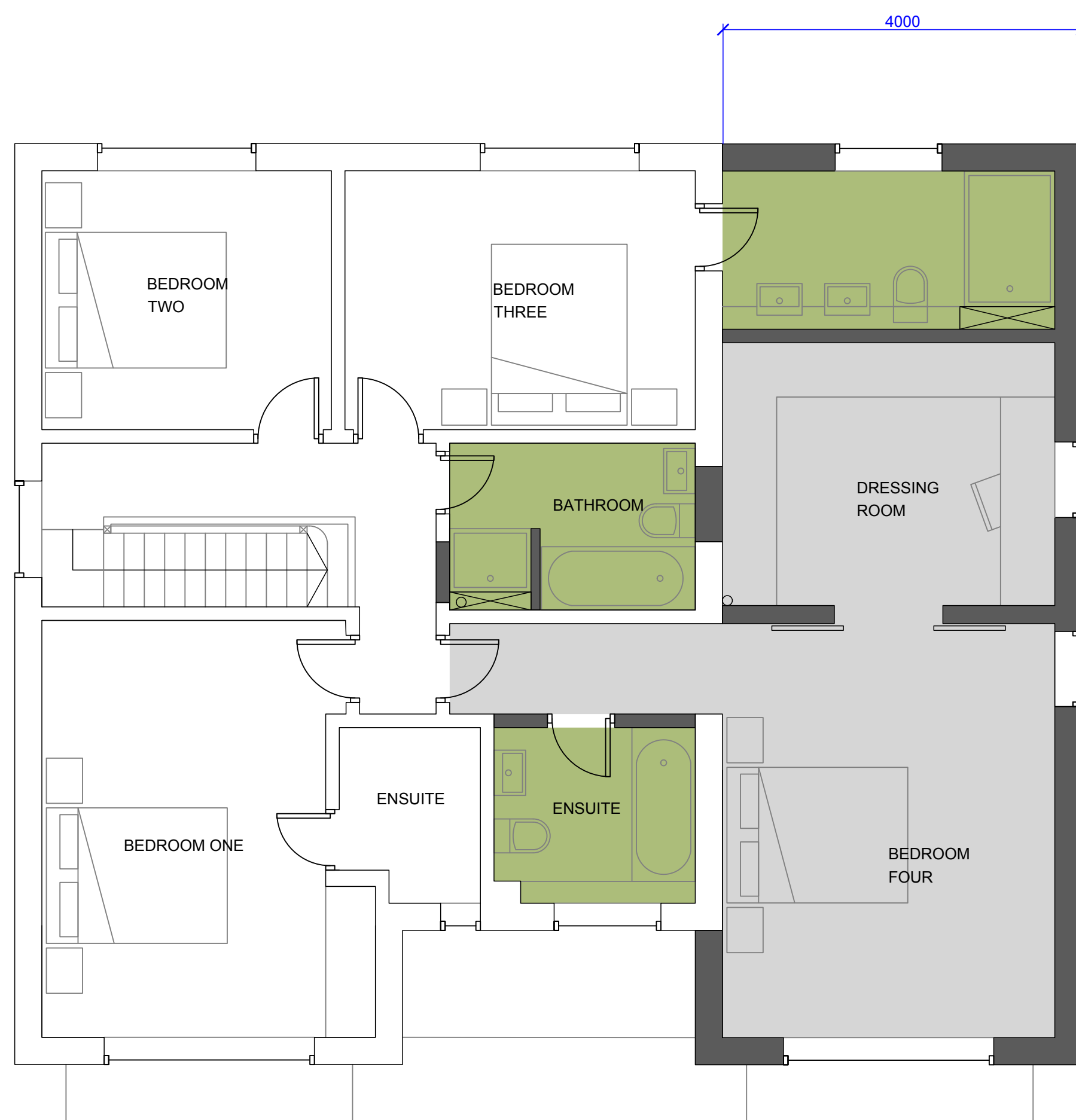
Proposed First Floor Plan 1:100@ A3