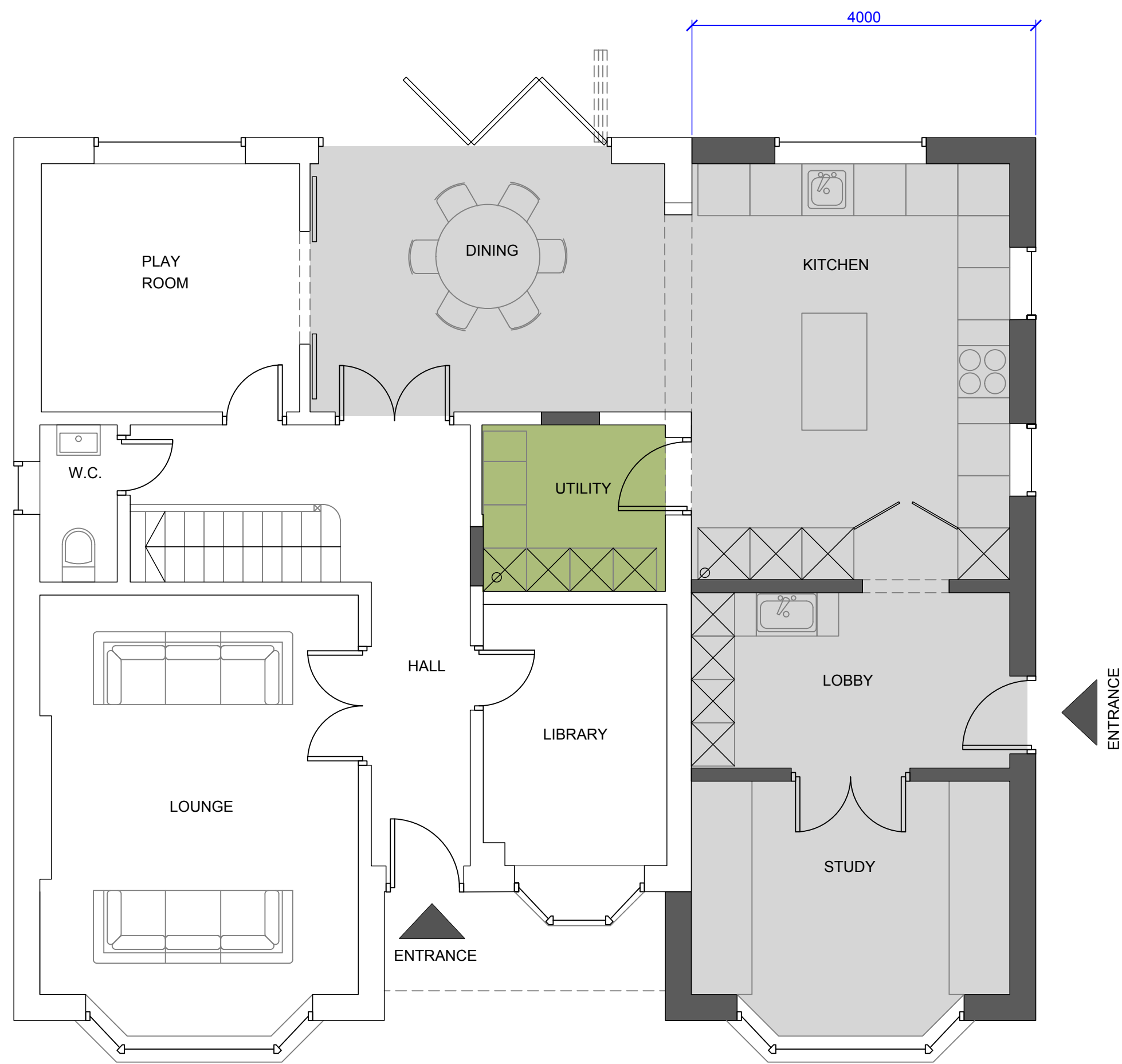
Proposed Ground Floor Plan 1:100@ A3