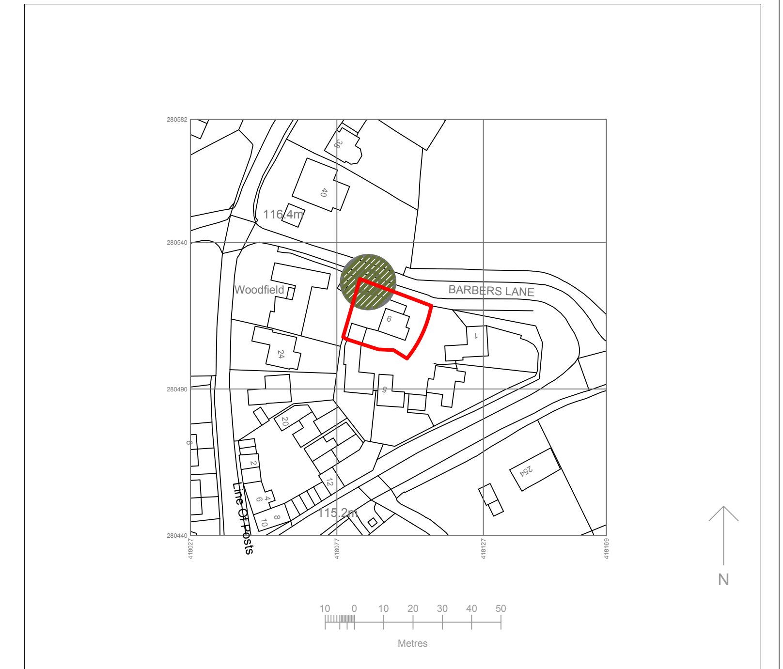
Location Plan 1:1250@ A1