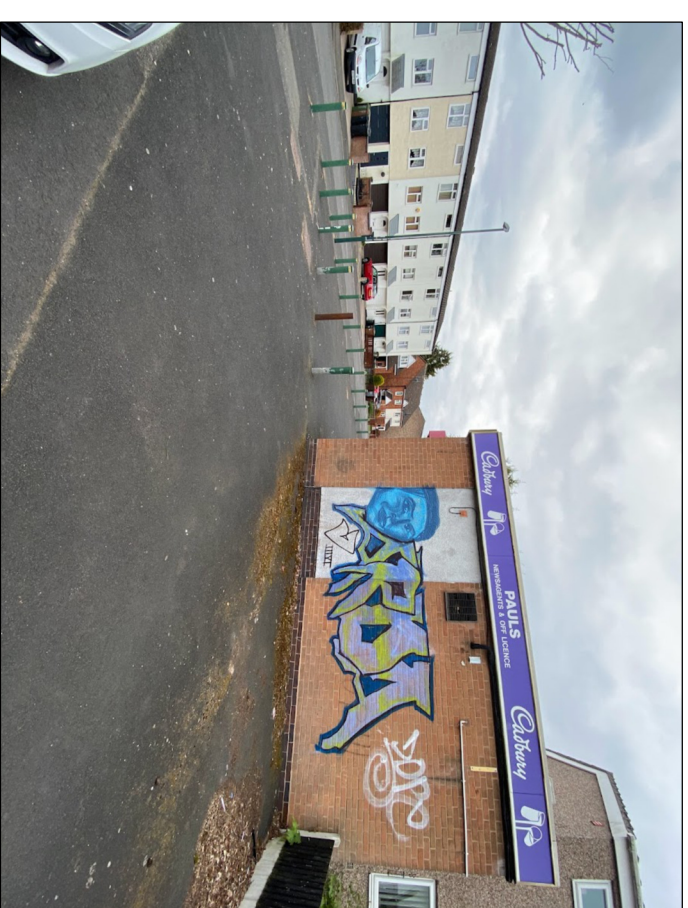
Existing view of shop from Kingfisher Drive