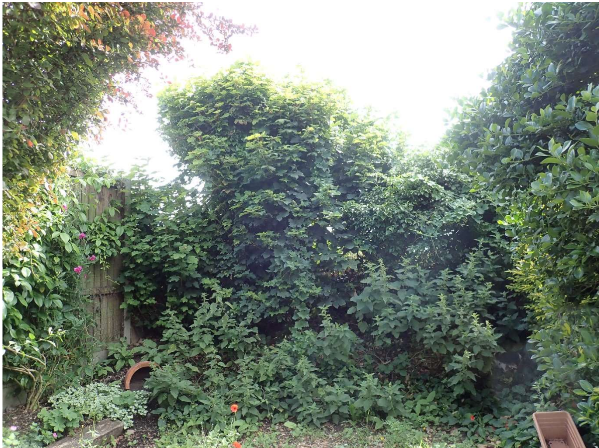
Hedge No 7

Tip-reduce the overhanging branches back to alternative growth points to allow more light into the garden and glass house.