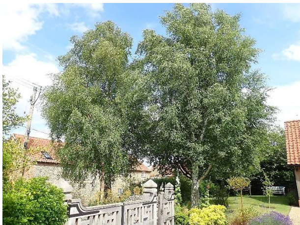
T1 & T2

Reduce and shape the upper crown, similar to previous reduction. Lower crown not to be reduced or raised to maintain screen. Estimated height after reduction 7m.