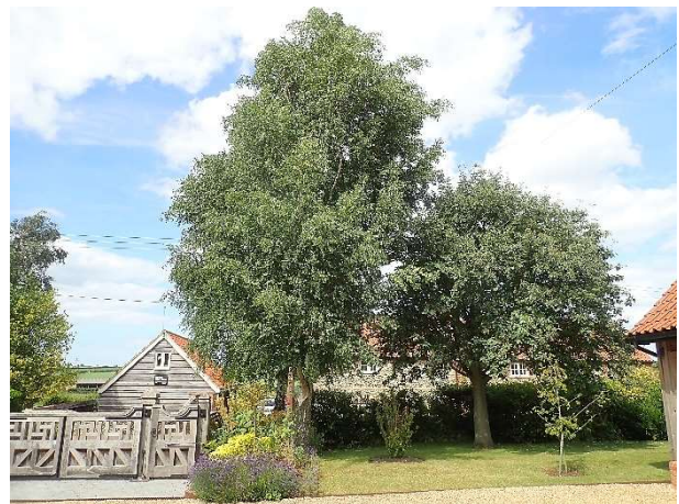
T2 & T3