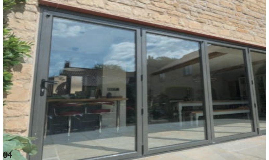
04 External Doors ALUMINIUM (COLOUR ANTHRACITE GREY)