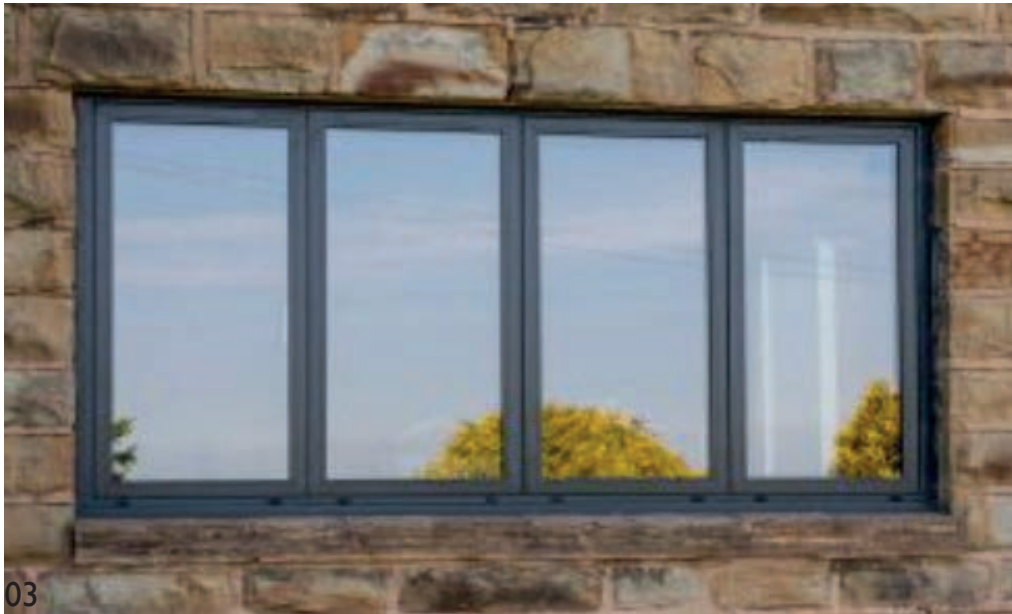
03 Windows: ALUMINIUM - ALITHERM 300 (COLOUR ANTHRACITE GREY)