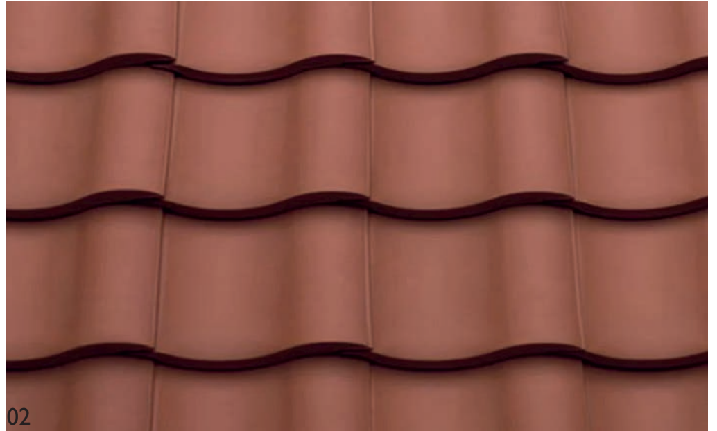
02 Roof Tiles SANDTOFT NEO PLUS – NATURAL RED