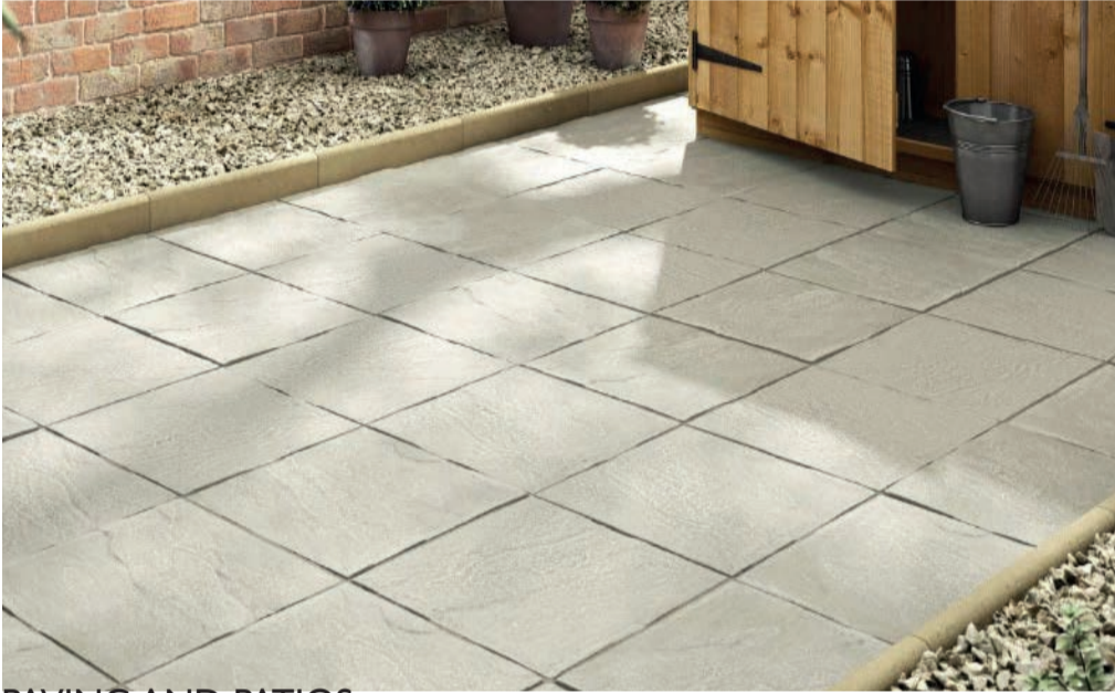
PAVING AND PATIOS Marshalls pendle 450x450mm slab (Natural colour)