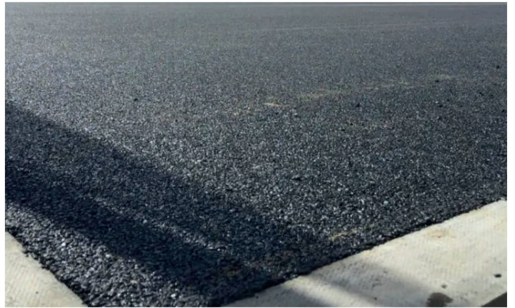
ROAD & PARKING BAYS Tarmacadam road surfacing