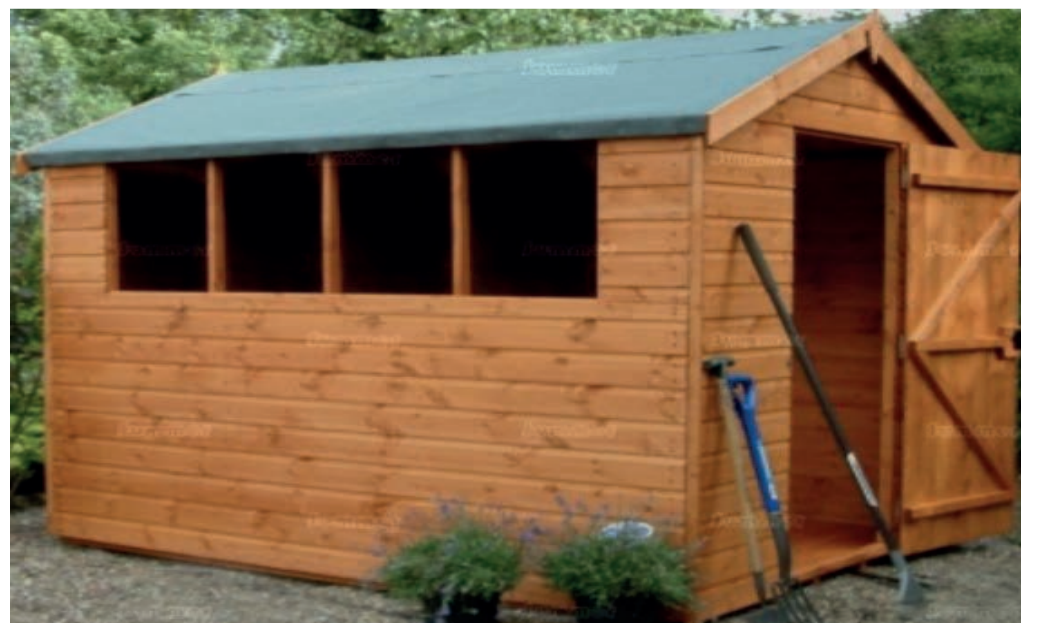
TIMBER SHED Exact model to be confirmed To be used as cycle storage