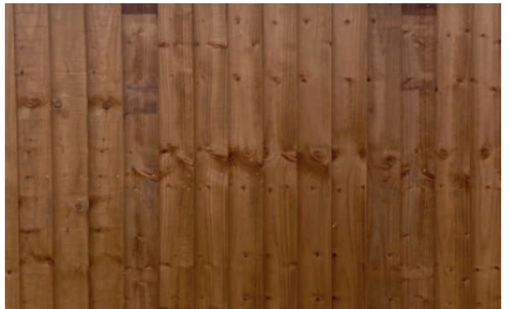
FENCING KS timber Feather edge