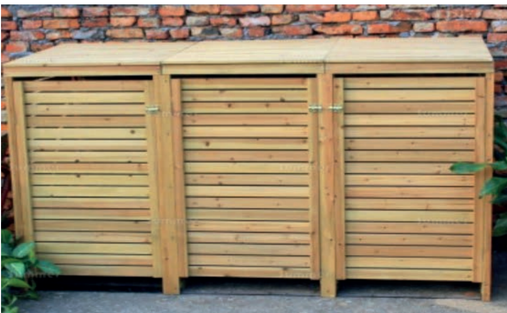
TIMBER BIN STORE Wheelie Bin Store 151 - Wooden Slatted, FSC® Certified Containing 3 x 360 litre bins