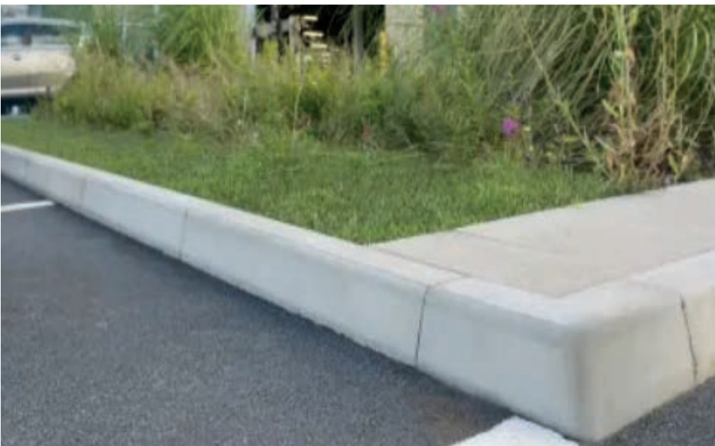
KERBING Marshalls PCC 50x150 edging & 125x150mm kerb.