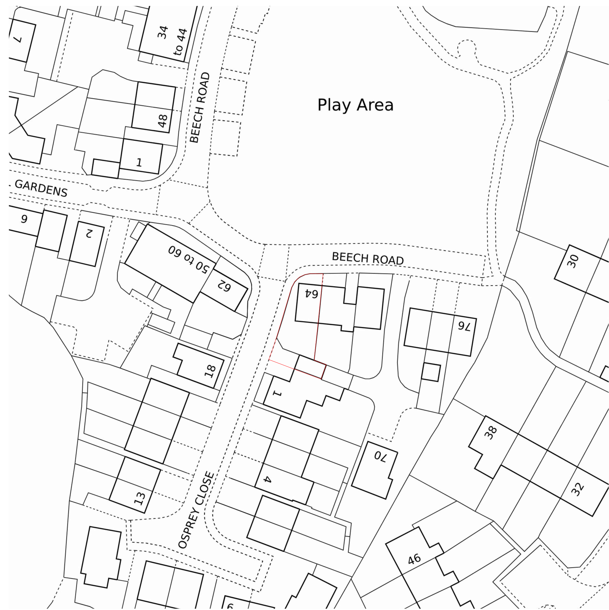
Proposed Block Plan (no proposed change)