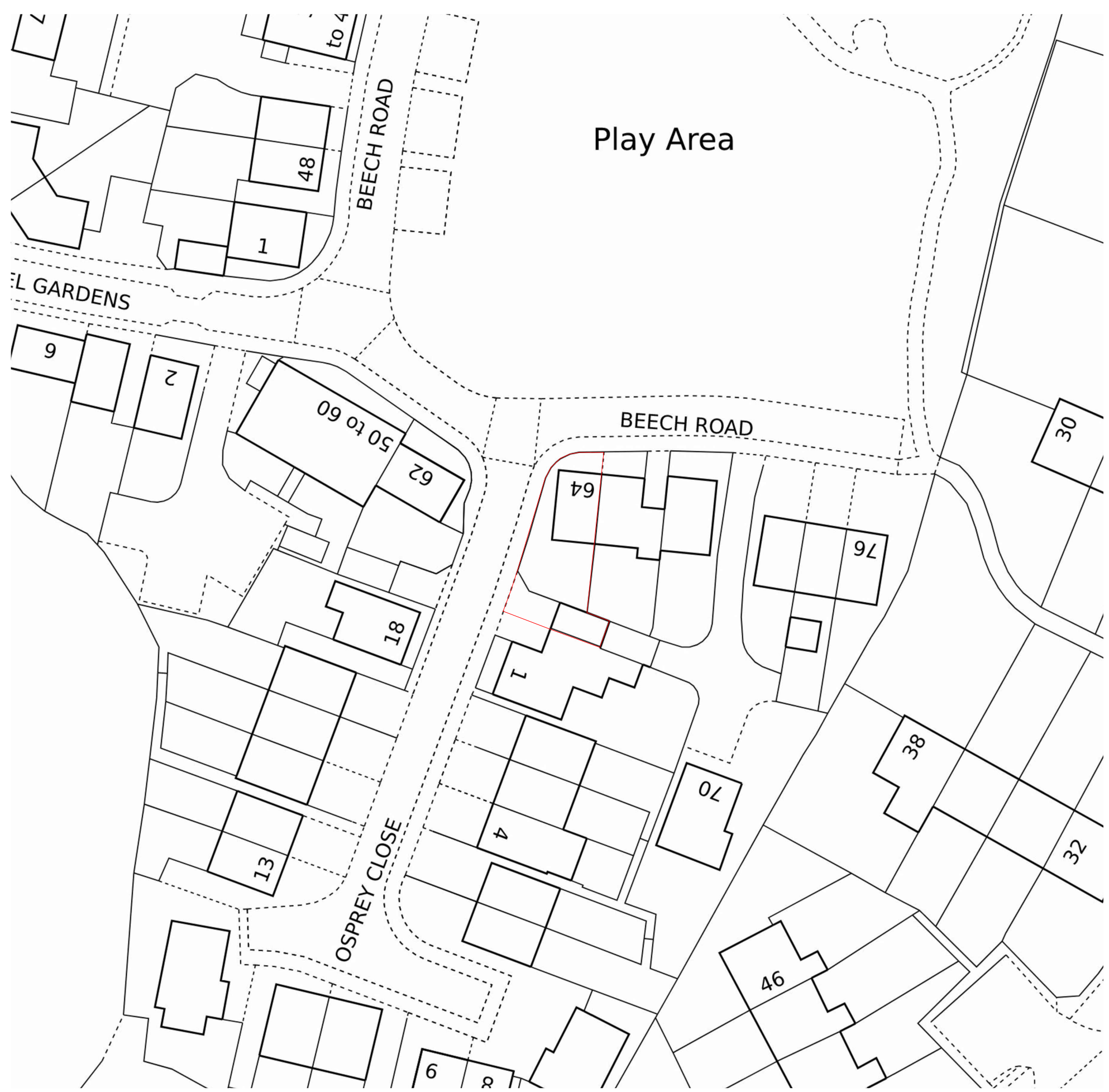
Existing Block Plan