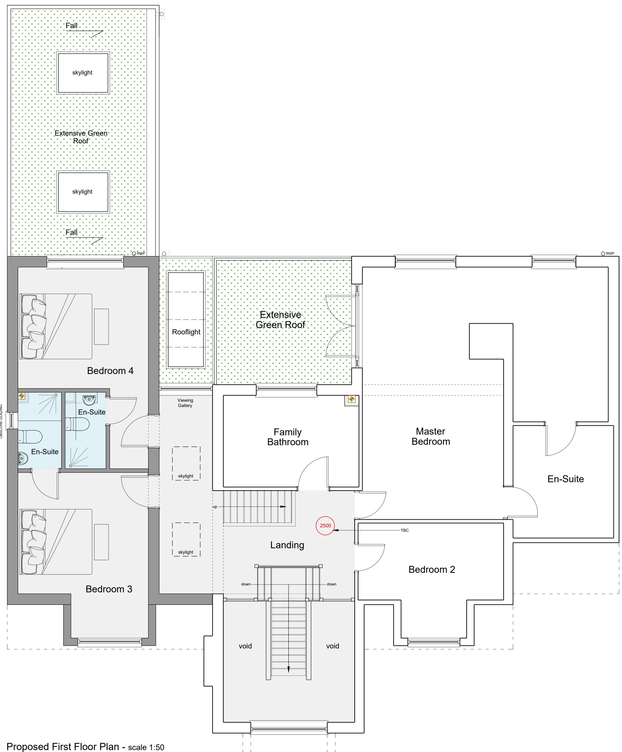
Proposed First Floor Plan - scale 1:50

NOTES Contractors must check all dimensions against the existing structure on site and be satisfied that all dimensions shown are available. Only signed dimensions are to be worked from. Checkers must be marked to the Architect or Engineer before proceeding. © This drawing is copyright. It is the responsibility of the contractor, check existing drainage and boundary positions prior commencement of work carried out on site.