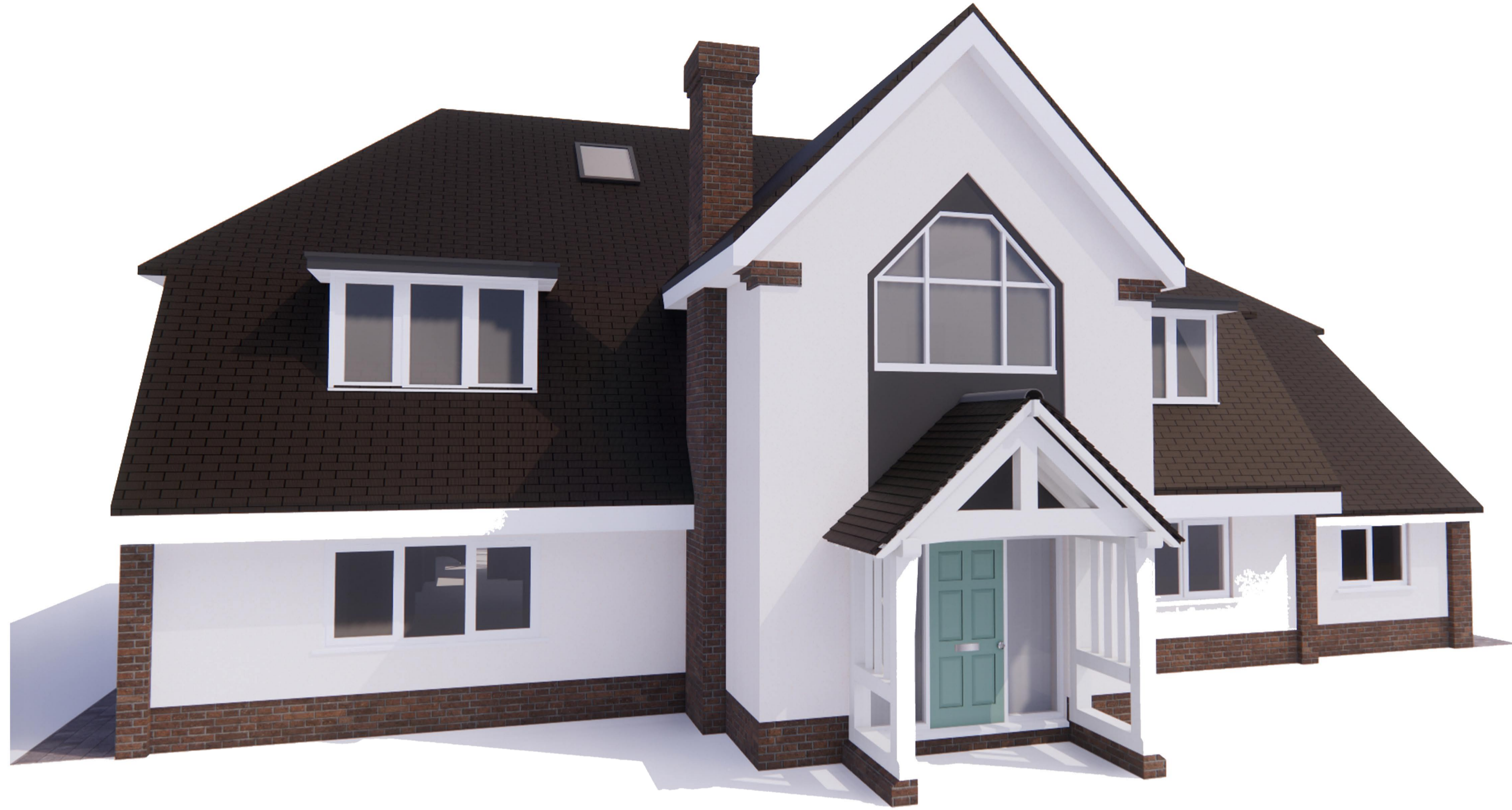
Front Perspective - NTS