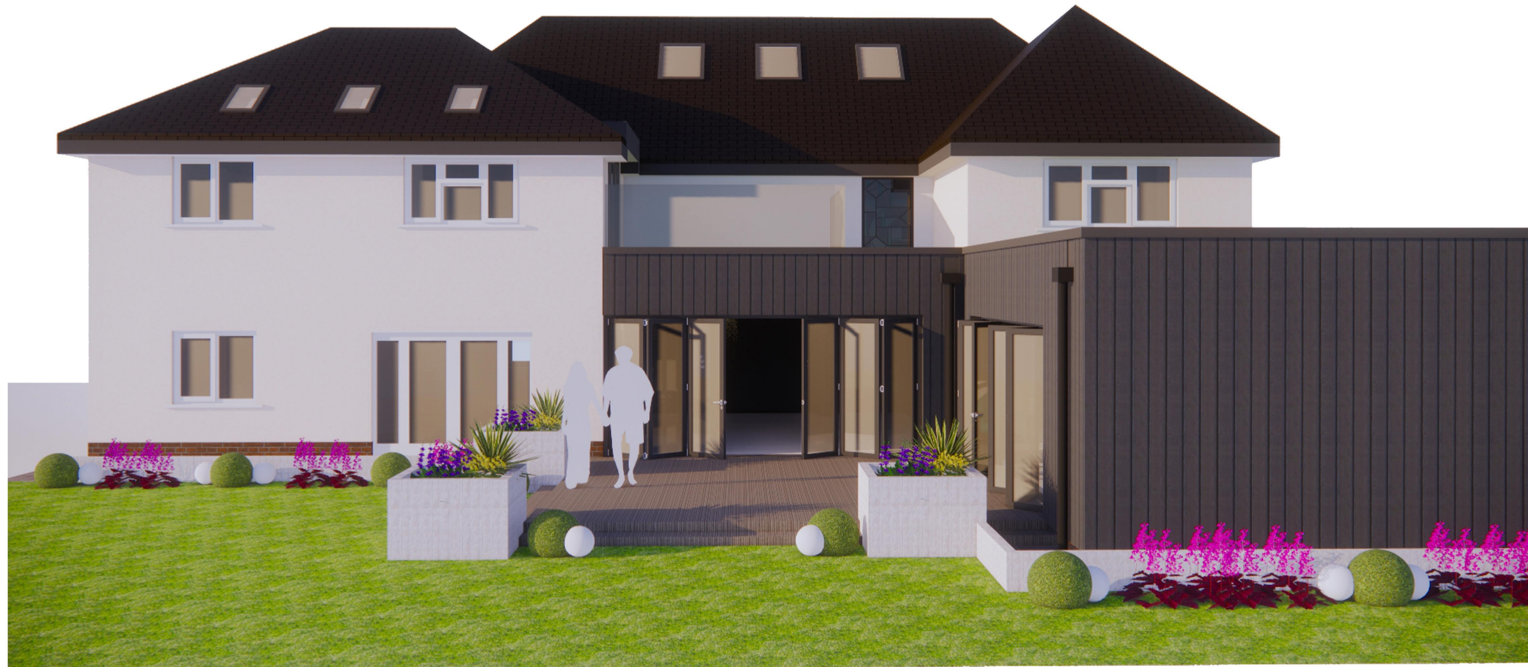
Rear Perspective - NTS