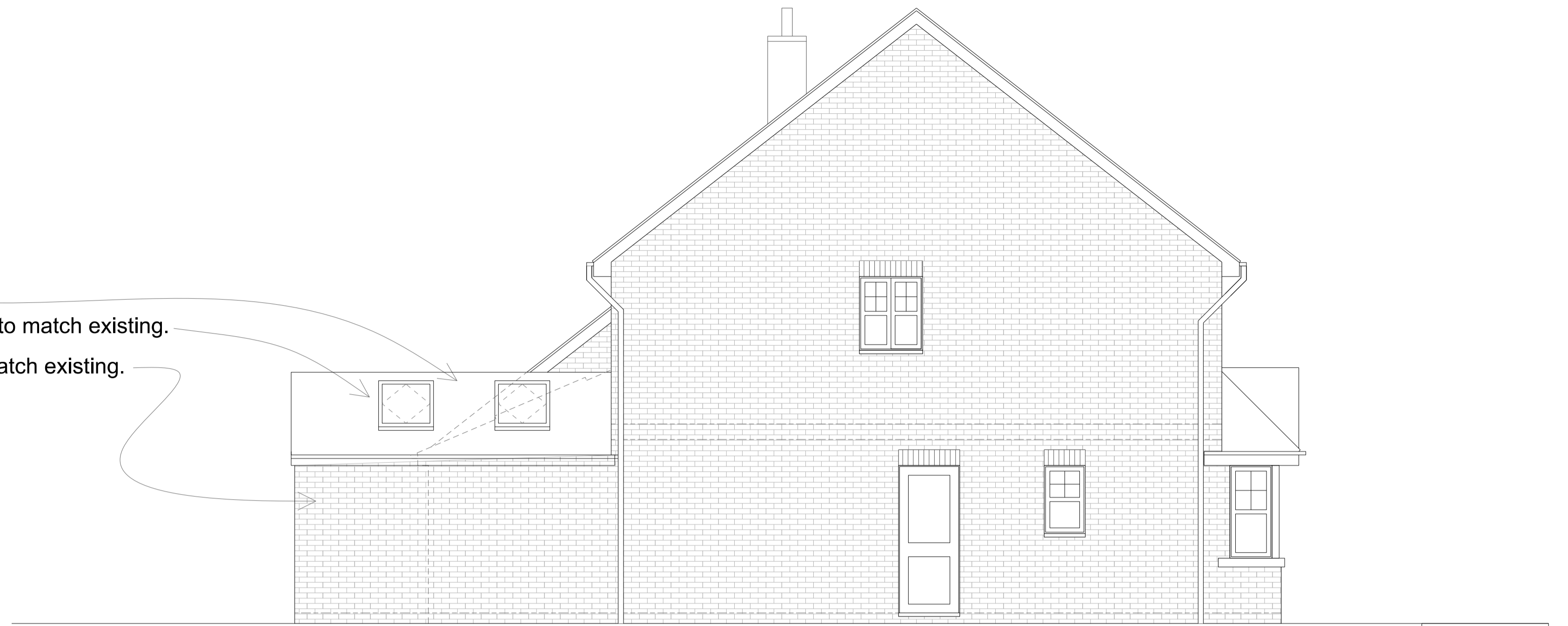
PROPOSED SIDE ELEVATION (N)

New rooflights Proposed concrete pantiles to match existing. Proposed facing bricks to match existing.