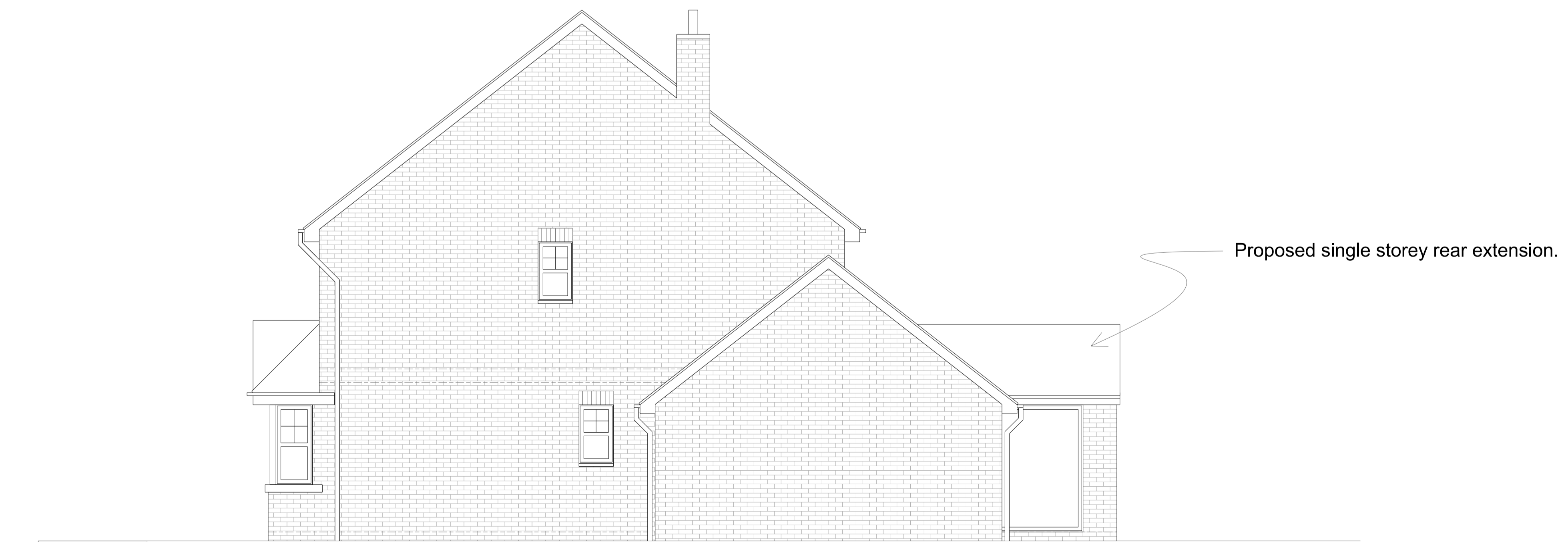
PROPOSED SIDE ELEVATION (S)