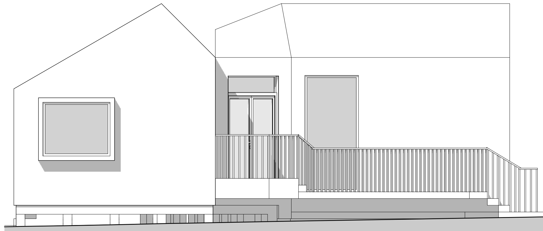
South West Elevation 1:50