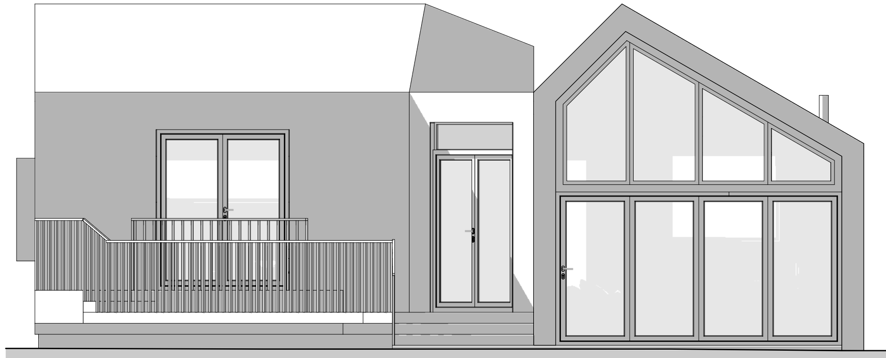
South-East Elevation 1:50