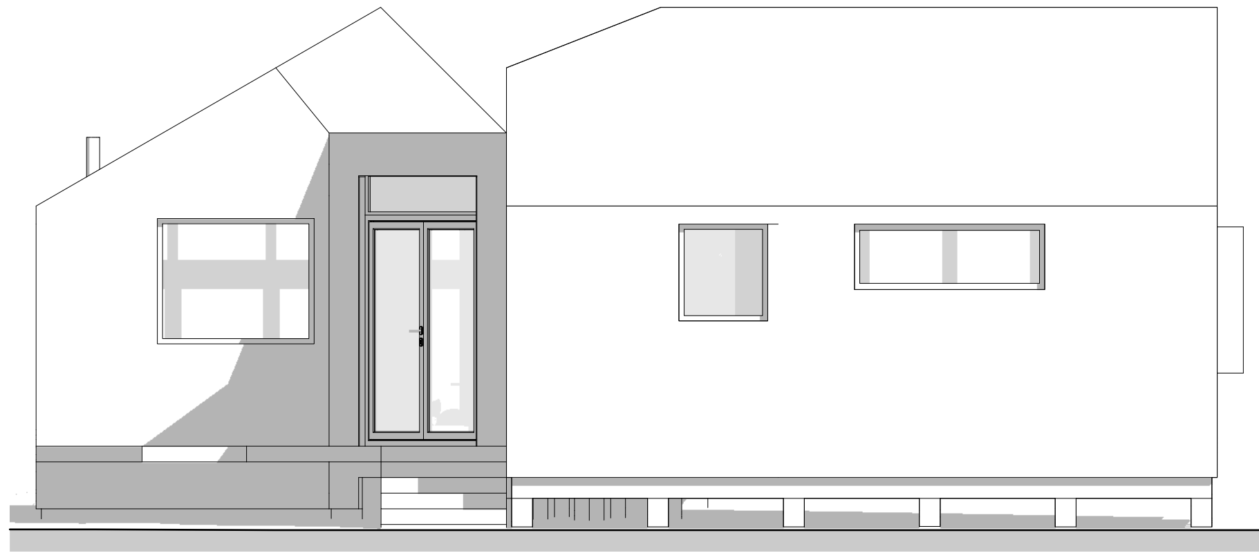
North West Elevation 1:50