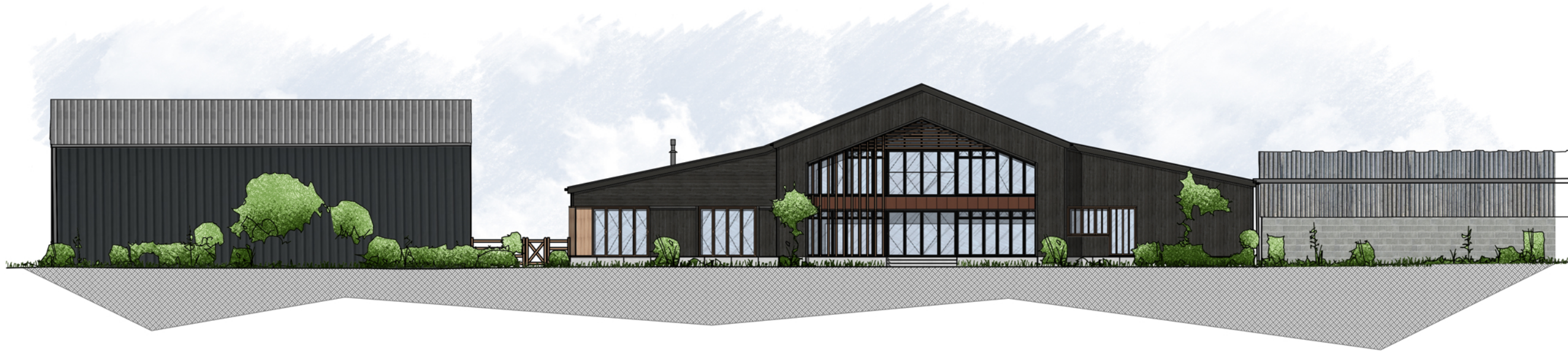
Proposed Rear Elevation Scale 1:200 @ A3