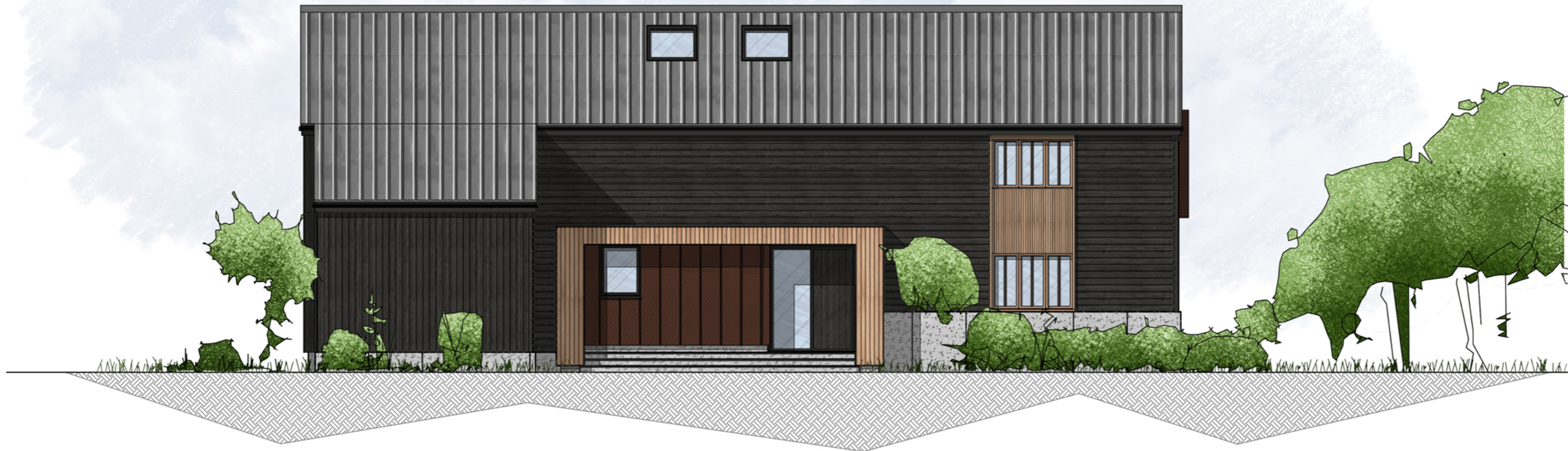
Proposed Side Elevation (North) Scale 1:100 @ A3