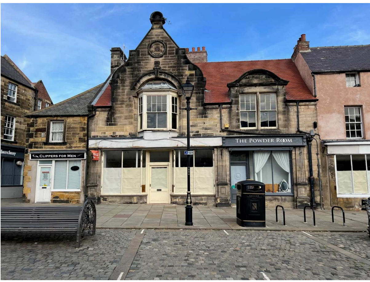
Non Listed Building.

fronts. The first floor has a projecting timber bay window, complete with 3 timber sliding sash windows with glazing bars and a pitched lead roof.