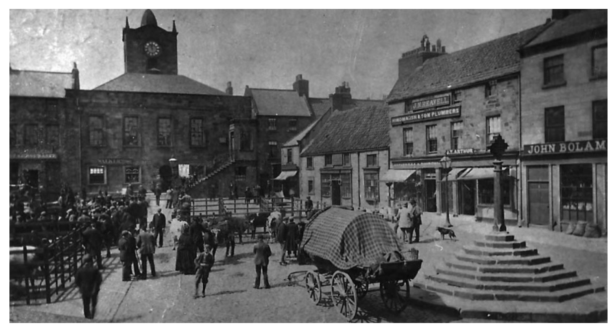
Alnwick Market Place ca. 1890

The proposals would look to simply the current floor plans, amending the many differing floor levels at first floor level. The two domestic units would then be opened up to create one large two bed luxury serviced accommodation unit, covering both the first and second floors.