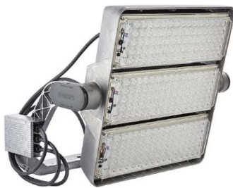
Figure 1 – Example LED

Please refer to 'Appendix B – LED Floodlight Data Sheet' for further details.