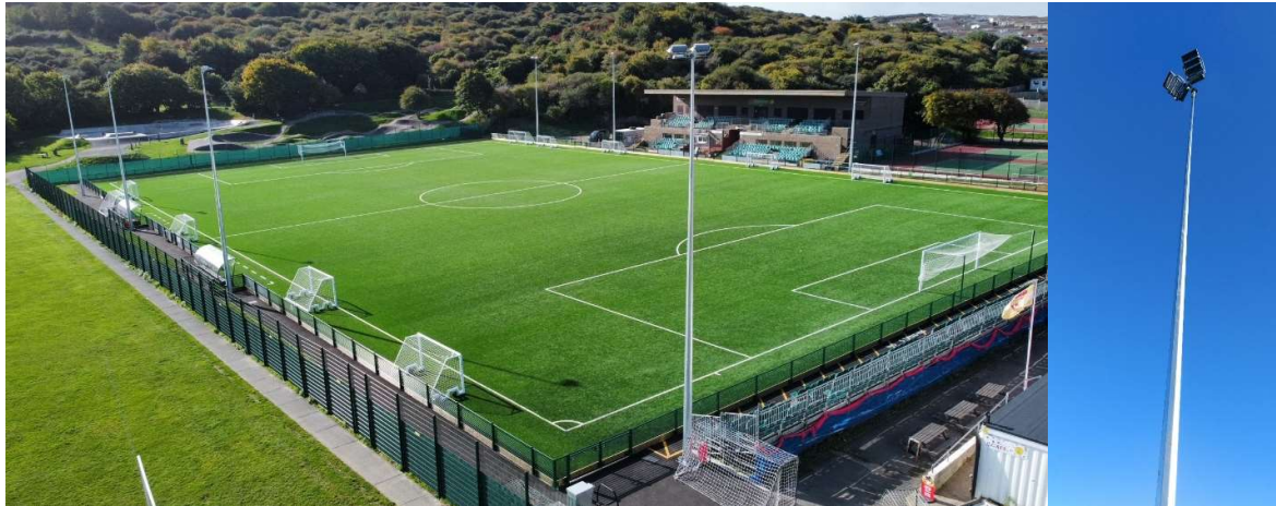
Figure 2 – Examples of 15m high slimline floodlighting column with LEDs (proposal is for 13m columns)

On this basis, 13m high mounting heights provide the most efficient solution and the proposed masts will offer a slim-line profile, which will minimise daytime impact.