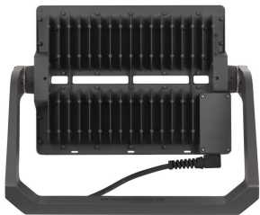
Rear View of BVP517 floodlight (BV : With External Driver Box, Grey painted housing)