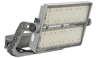
OptiVision LED gen3.5 Small