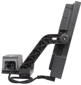
Side View of BVP527 floodlight (HGB : With attached Driver Box, Grey painted housing, Al Colour Driver housing)