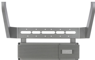
Driver Box top view HGB version