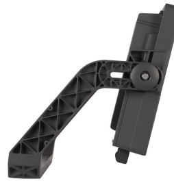
Side View of BVP517 floodlight (BV : With External Driver Box, Grey painted housing)