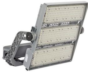
OptiVision LED gen3.5 Large