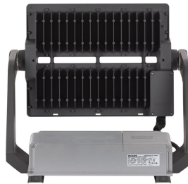
Rear View of BVP517 floodlight (HGB : With attached Driver Box, Grey painted housing, Al Colour Driver housing)