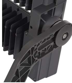
Access Bolt to AIM the BVP517 floodlight easily (Grey painted housing)