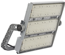
OptiVision LED gen3.5 Large