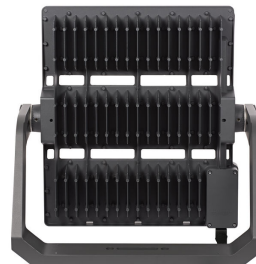
Rear View of BVP527 floodlight (BV : With External Driver Box, Grey painted housing)