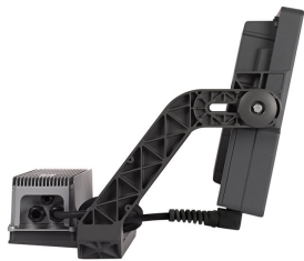
Side View of BVP517 floodlight (HGB : With attached Driver Box, Grey painted housing, Al Colour Driver housing)