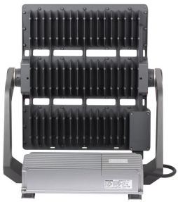
Rear View of BVP527 floodlight (HGB : With attached Driver Box, Grey painted housing, Al Colour Driver housing)