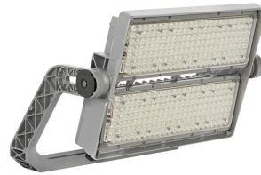
OptiVision LED gen3.5 Small