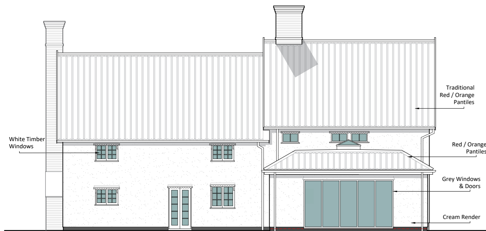
Proposed North Elevation 1:100

The boxes should have an unobstructed approach and no artificial lighting should be directed towards them.