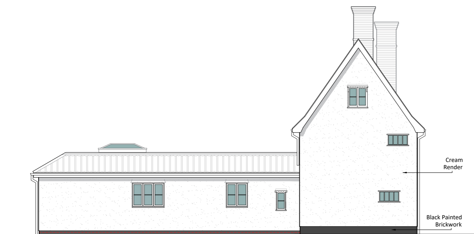
Proposed West Elevation 1:100