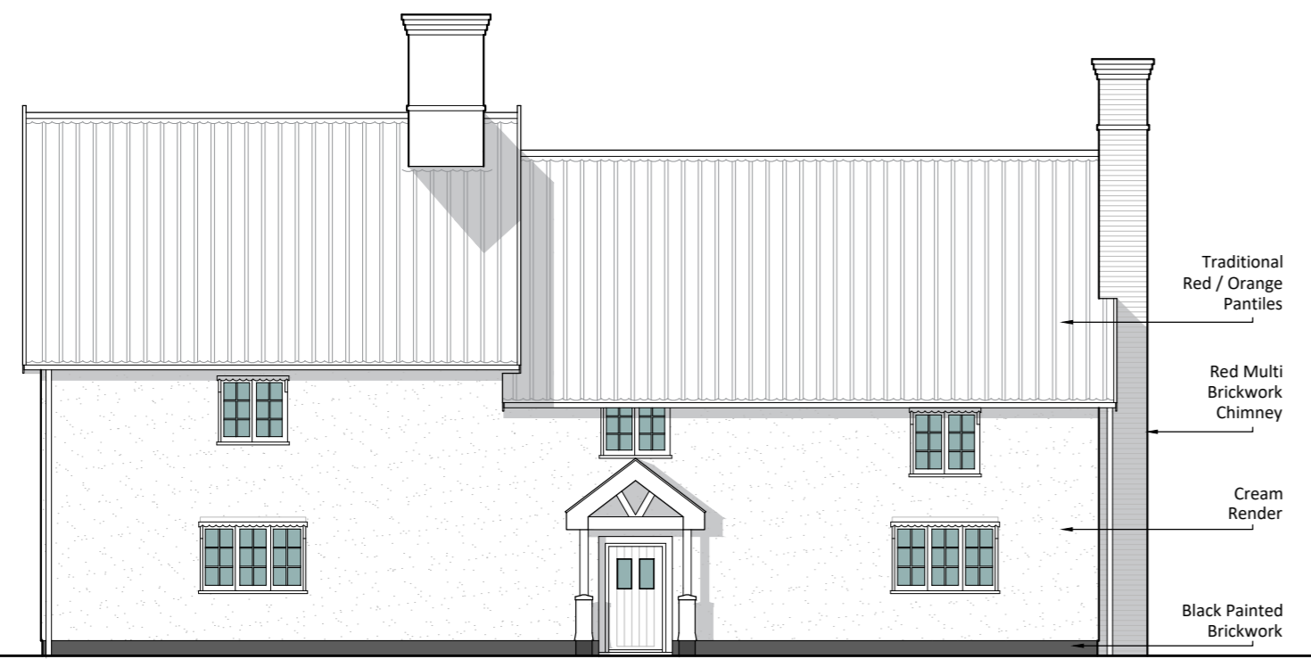
Proposed South Elevation 1:100