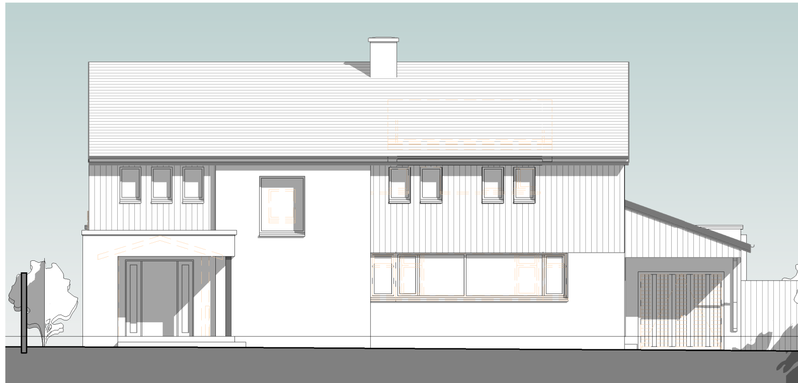
Proposed North Elevation 1 : 100