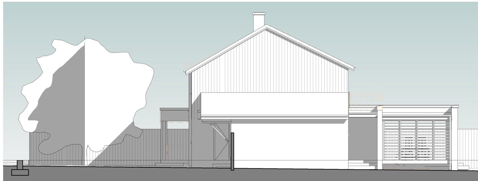
Proposed West Elevation 1 : 100