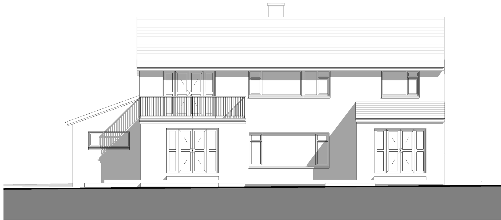
Existing South Elevation