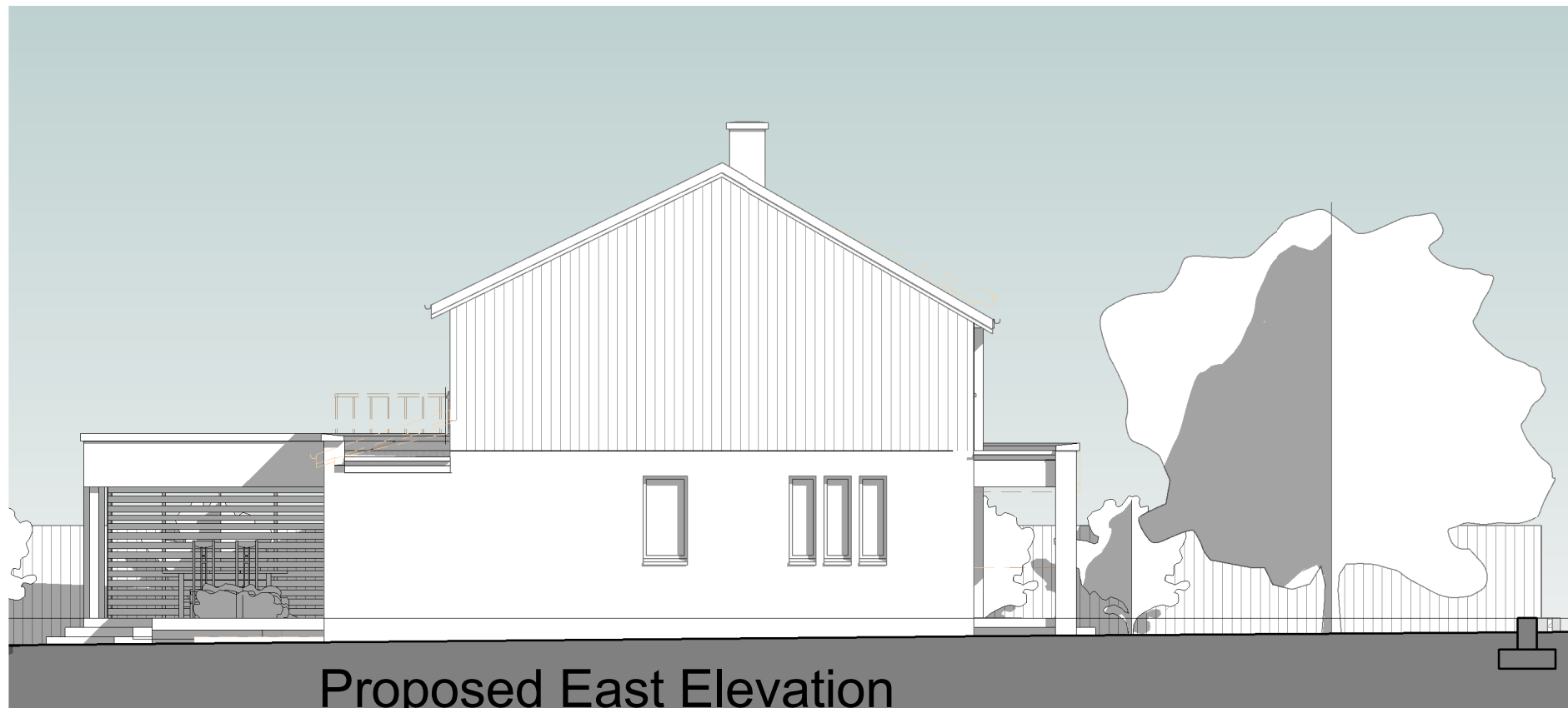
Proposed East Elevation 1 : 100