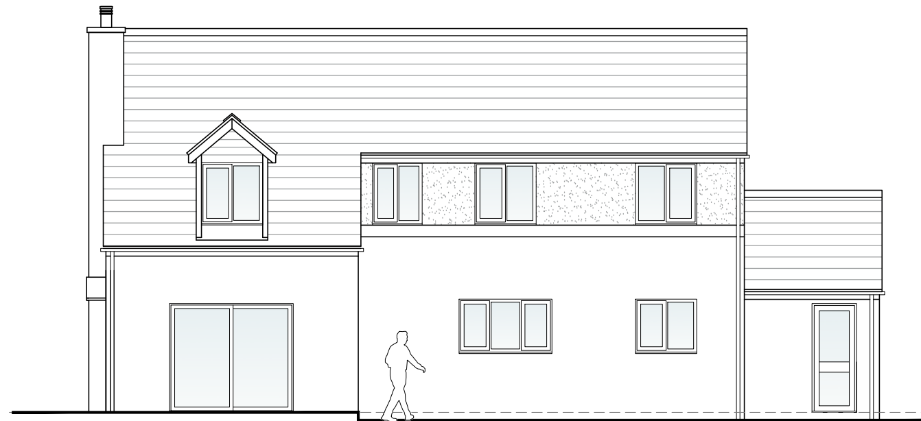
EXISTING NORTH ELEVATION 1:100@A3