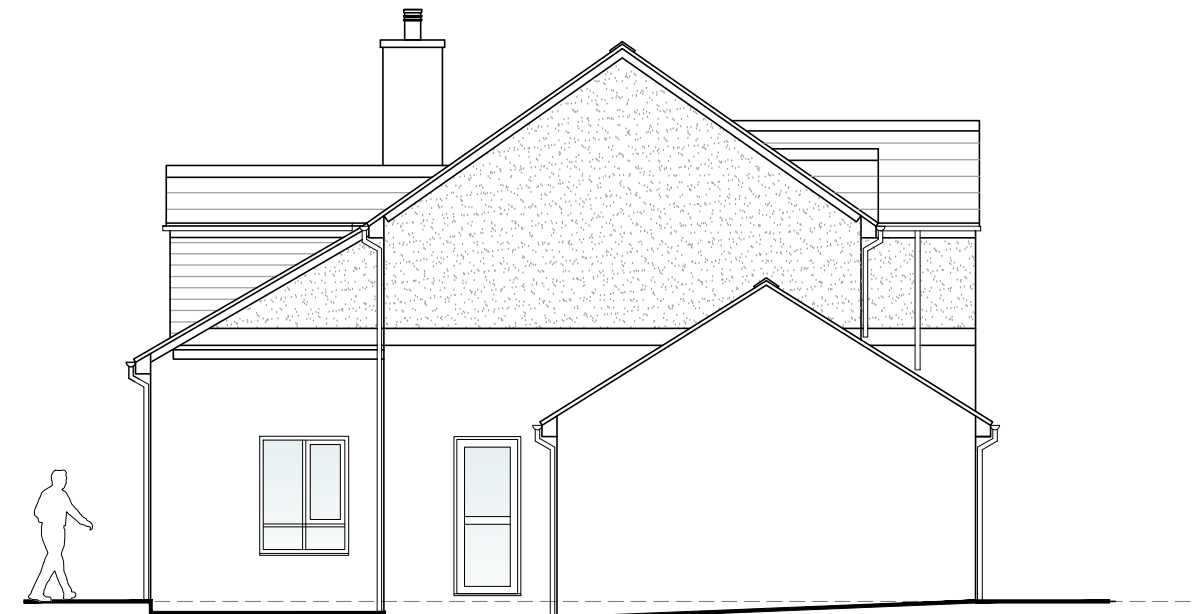
EXISTING WEST ELEVATION 1:100@A3