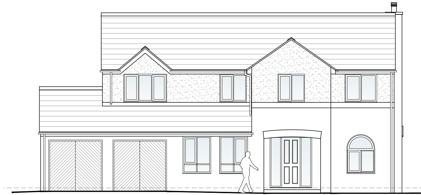
EXISTING SOUTH ELEVATION 1:100@A3