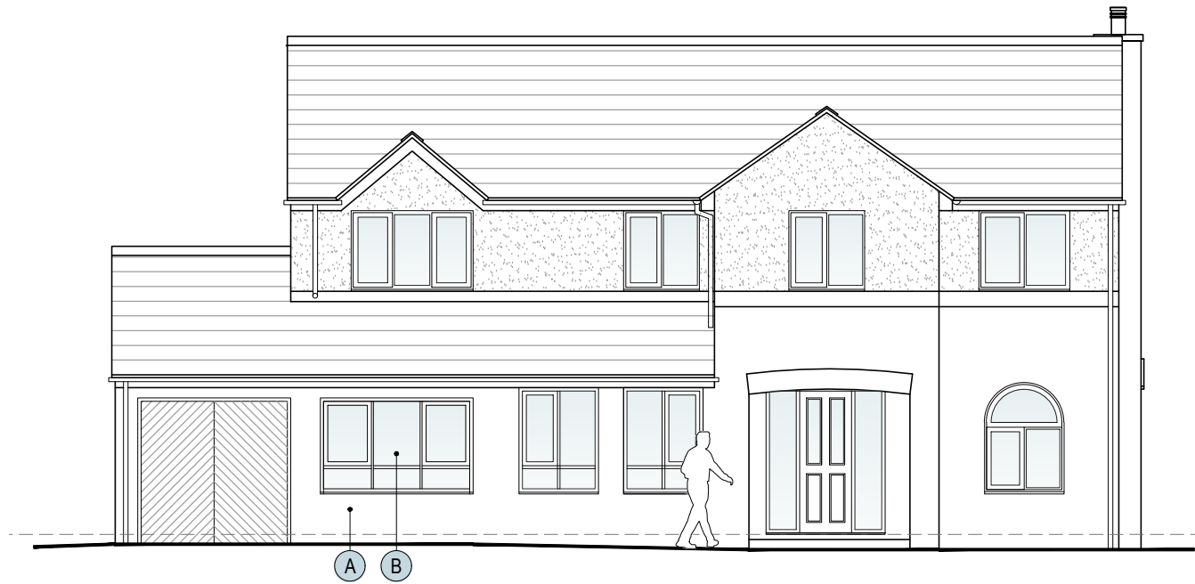
PROPOSED SOUTH ELEVATION 1:100@A3