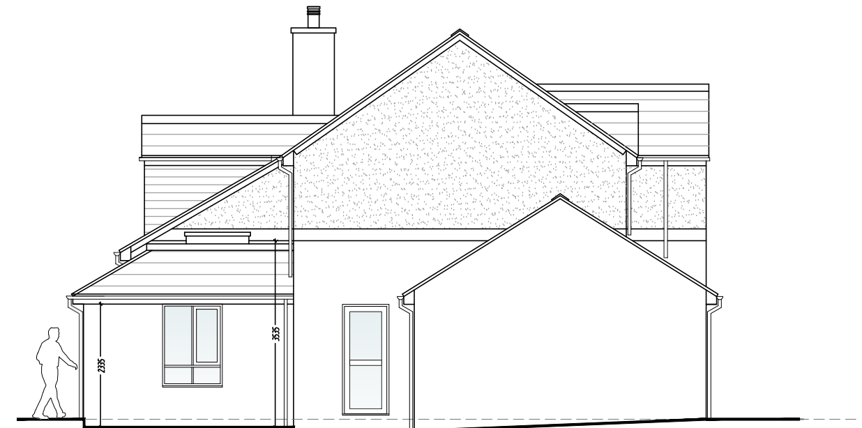
PROPOSED WEST ELEVATION 1:100@A3