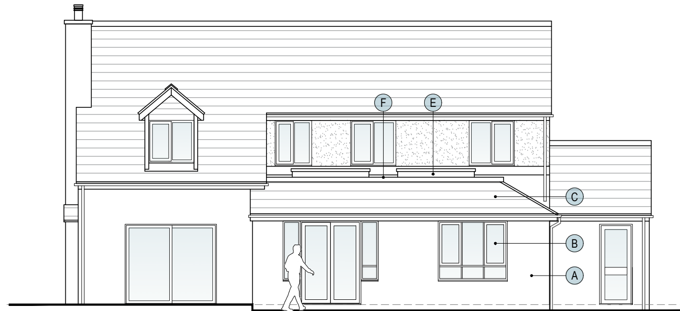
PROPOSED NORTH ELEVATION 1:100@A3