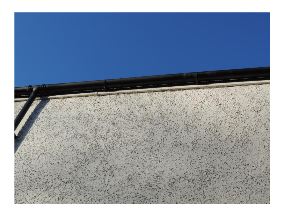
Photo 13: Note tight seal to fascia board of flat-roofed section of building

There is no vegetation affected by the project that has crevices, loose bark or woodpecker holes that might be colonised by bats.