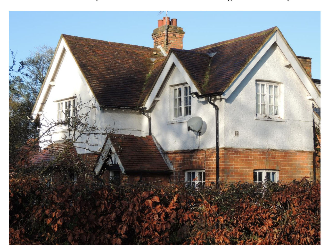
Photo 1: From the south-east. The proposal is to demolish and replace the property

As part of a planning proposal involving a residential property at The Bailiff's House, 5 Benington Park Farm, Benington, Stevenage, Hertfordshire SG12 7BU, a site visit was conducted on 23<sup>rd</sup> February 2022 to determine whether the building had been used by bats.