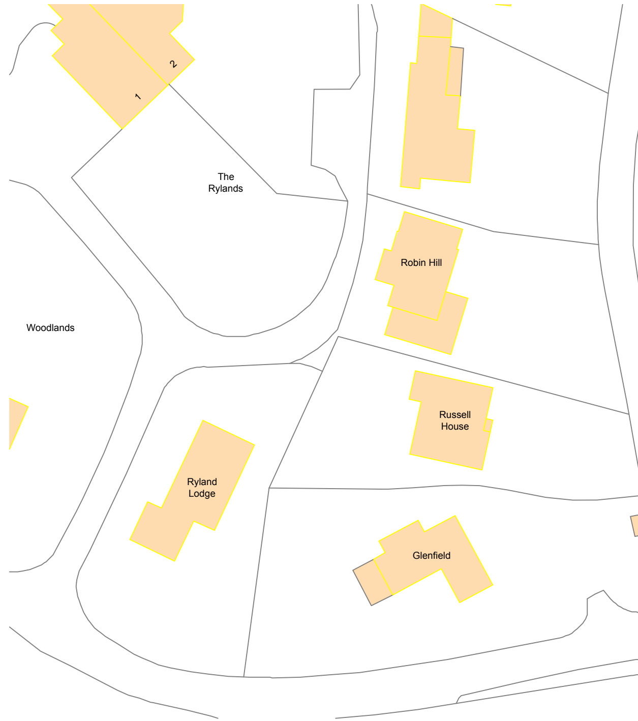
BLOCK PLAN 1:500