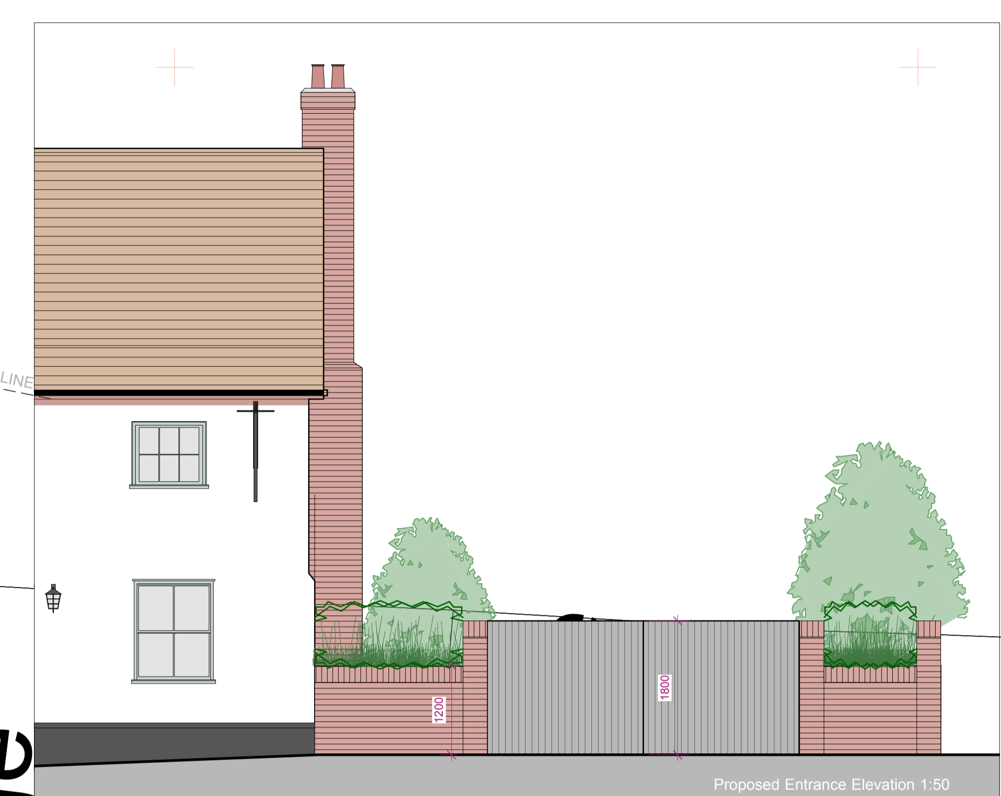
Proposed Entrance Elevation 1:50