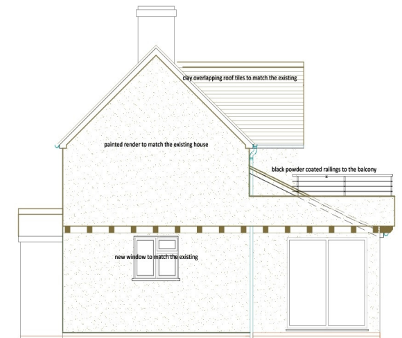
Proposed Rear Elevation : Side [West]

We believe the proposal is enhancement to the existing, Allows a better arrangement for the family life style and does not have any visual impact on the neighbours or viewing from passing traffic.